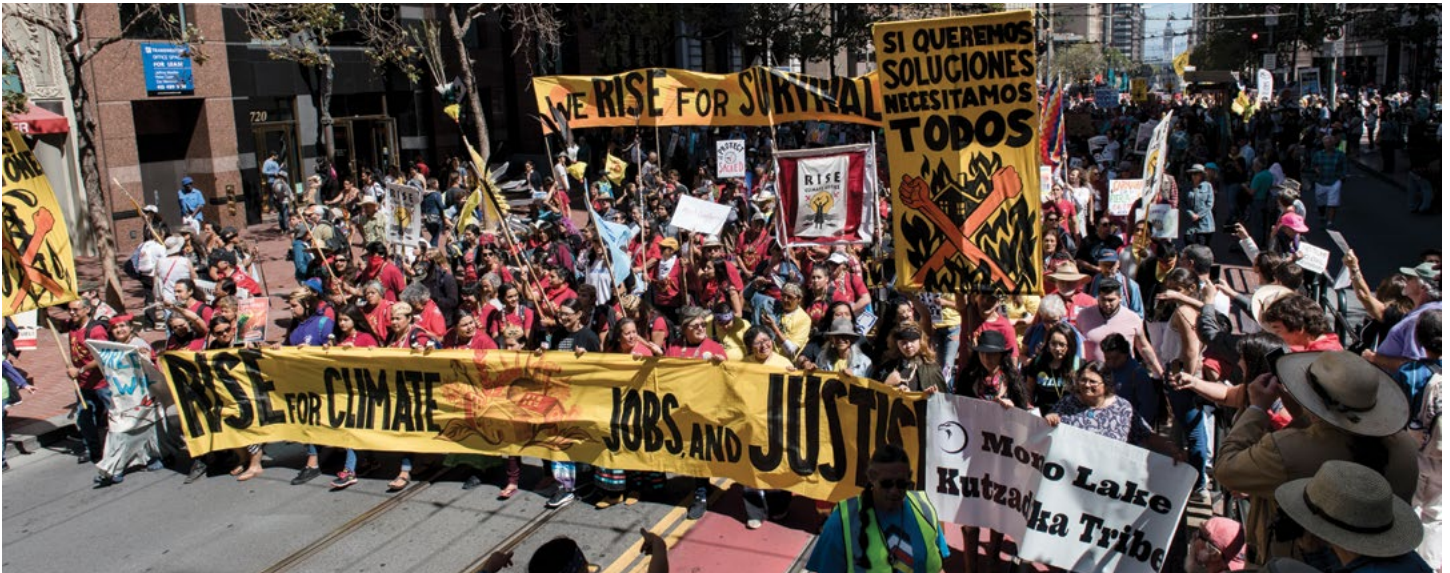
Rise for Climate, Jobs & Justice March in San Francisco