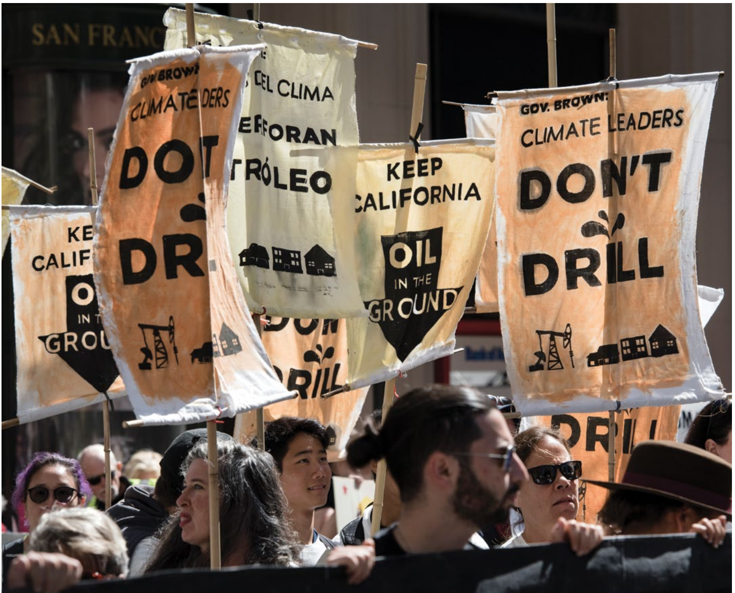
Rise for Climate, Jobs & Justice March in San Francisco

As climate disasters and planned blackouts roil the state, the need for urgent climate action could not be clearer.