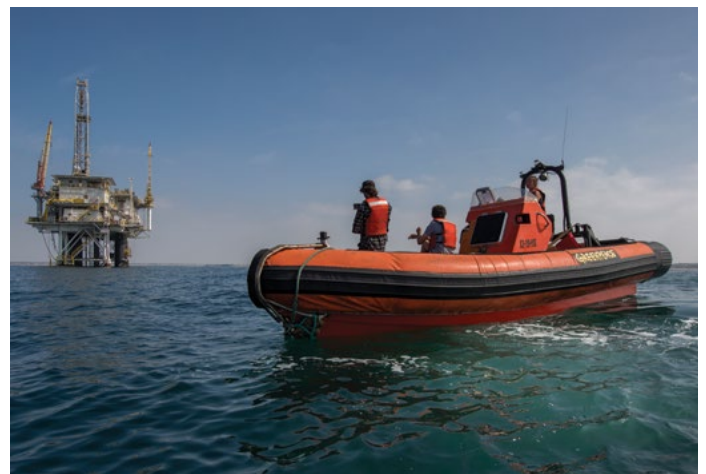
Offshore Oil FLIR Detection in California

Governor Newsom has taken some encouraging policy steps and has signaled that the oil and gas industry will play a declining role in California’s economy. If Governor Newsom can follow up these moves with an ambitious and visionary plan to phase out oil and gas production in the state, he would affirm California’s status as climate policy leaders, setting the pace for the U.S. and the world. What’s clear is that Californians from frontline communities and around the state will be watching his next moves with interest, and demanding solutions that leave no one behind.