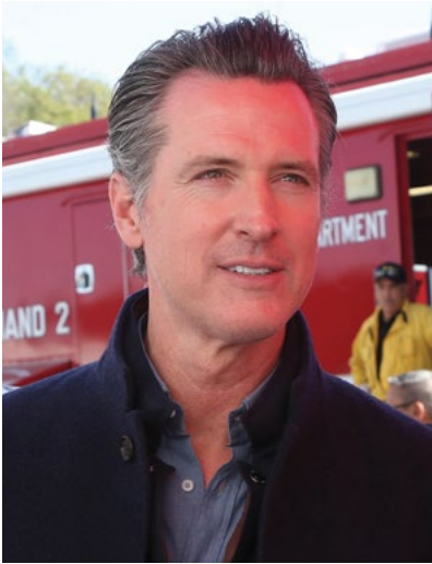
California's Governor Gavin Newsom

In January 2019, California's Governor Gavin Newsom was inaugurated as the leader of the world's fifth largest economy at a time of great peril and opportunity for our climate. In the next decade, we must cut emissions in half to be on track to limit warming to 1.5°C and avoid the most disastrous consequences of climate change. 1