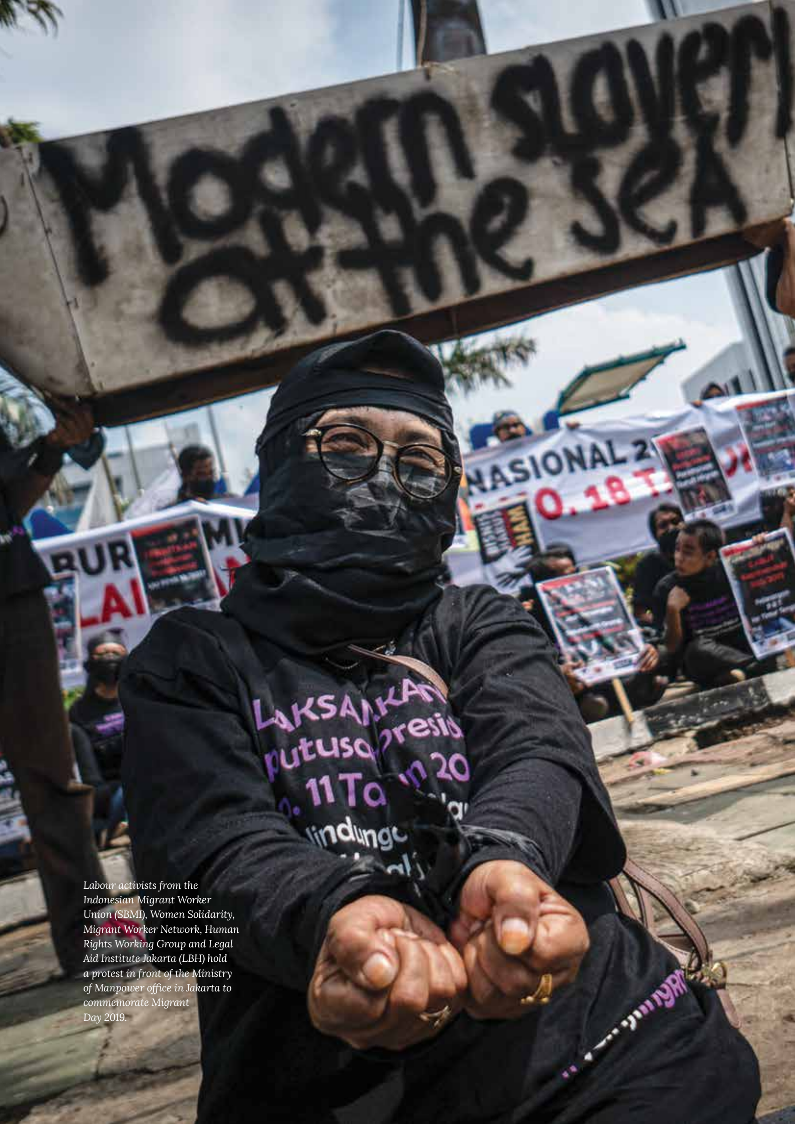
Labour activists from the Indonesian Migrant Worker Union (SBMI), Women Solidarity, Migrant Worker Network, Human Rights Working Group and Legal Aid Institute Jakarta (LBH) hold a protest in front of the Ministry of Manpower office in Jakarta to commemorate Migrant Day 2019.