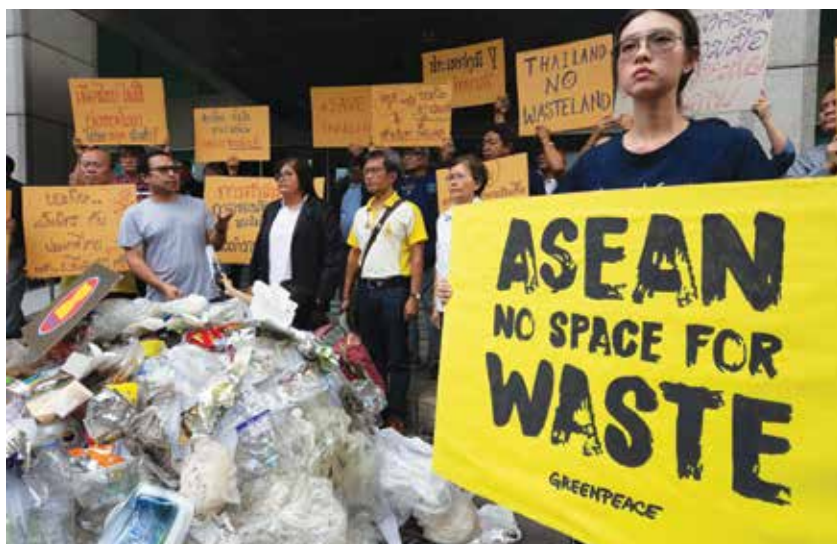
Activists hold banners during a protest, including Greenpeace activists and community representatives, at the Ministry of Foreign Affairs of Thailand during the 2019 ASEAN Summit in Bangkok.

In June, Greenpeace called on Southeast Asian leaders attending the 34 th ASEAN Summit in Bangkok to include the issue of foreign waste imports on their agenda.