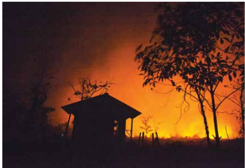
A silhouette of a house amongst forest fires burning close to Palangkaraya city, Central Kalimantan, Indonesia.

Analysis from Greenpeace International revealed consumer-goods giants, such