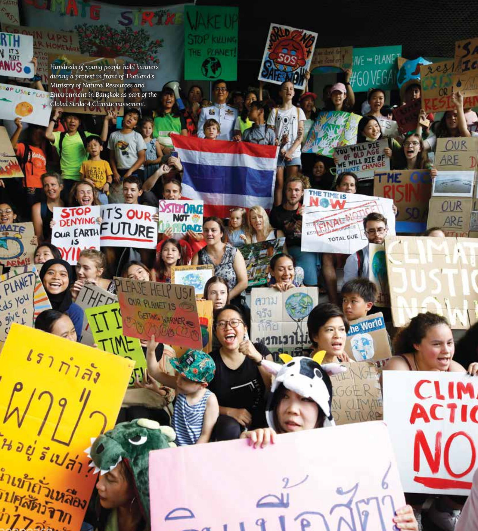
Hundreds of young people hold banners during a protest in front of Thailand's Ministry of Natural Resources and Environment in Bangkok as part of the Global Strike 4 Climate movement.