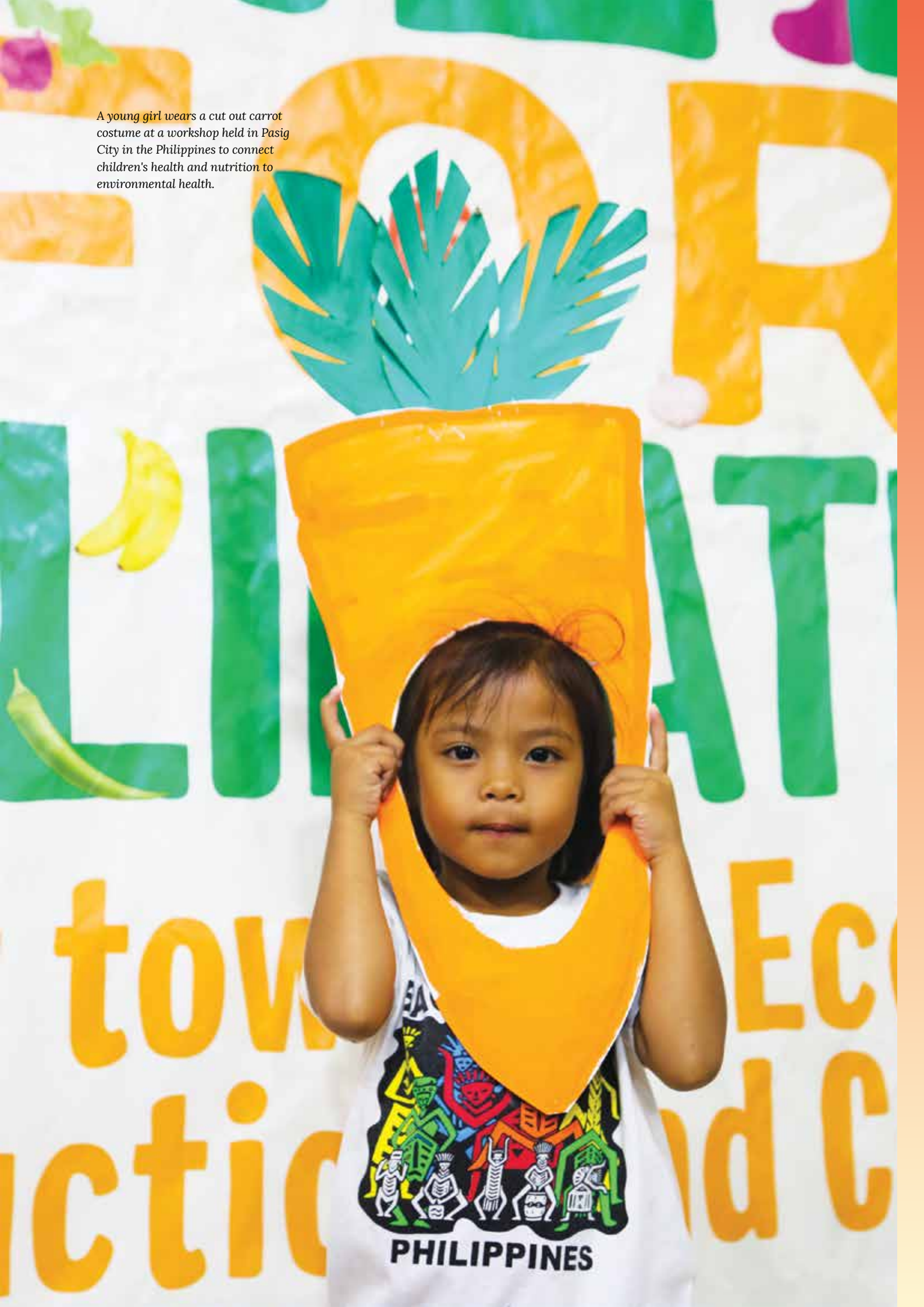
A young girl wears a cut out carrot costume at a workshop held in Pasig City in the Philippines to connect children's health and nutrition to environmental health.