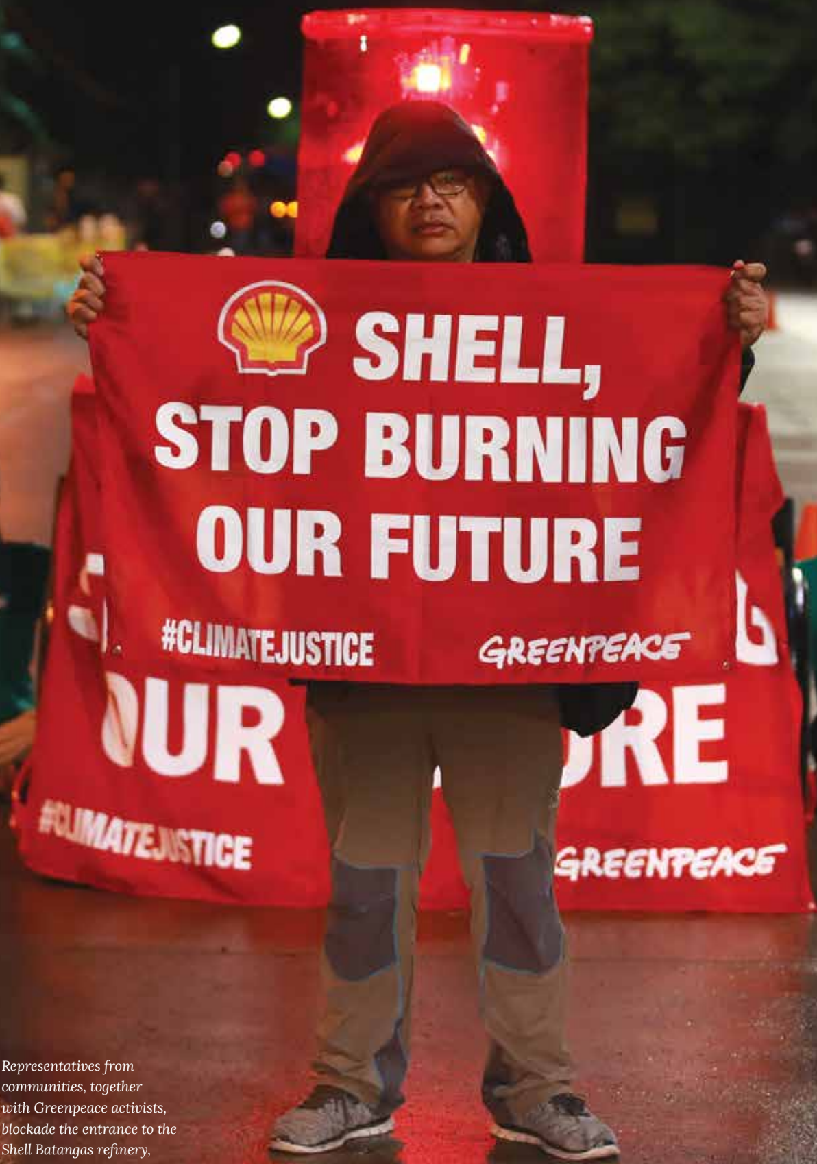
Representatives from communities, together with Greenpeace activists, blockade the entrance to the Shell Batangas refinery, south of Manila.