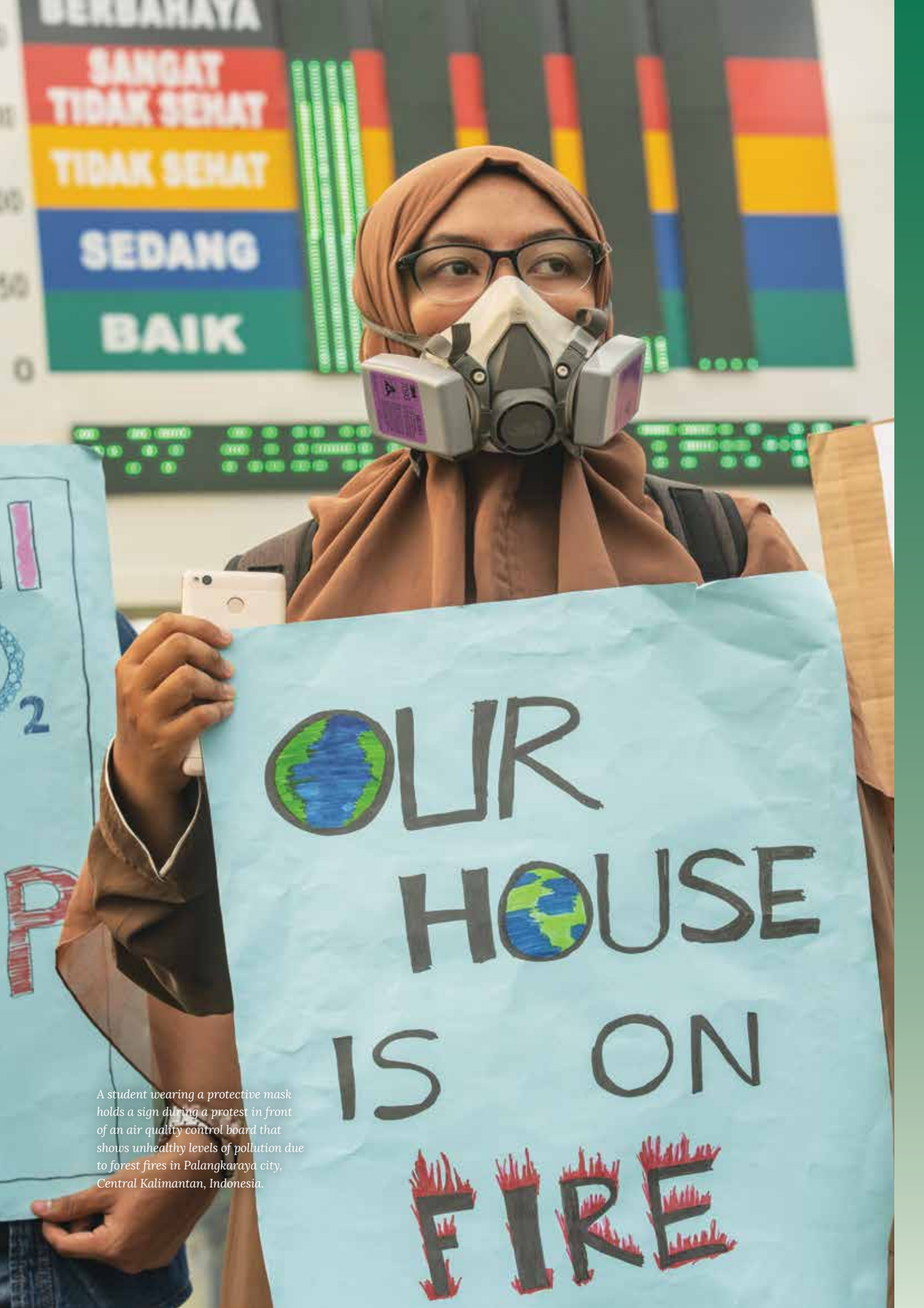
A student wearing a protective mask holds a sign during a protest in front of an air quality control board that shows unhealthy levels of pollution due to forest fires in Palangkaraya city, Central Kalimantan, Indonesia.