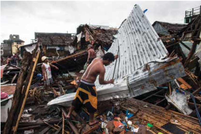
Workers repair damaged buildings in the aftermath of Typhoon Kammuri in Legazpi City, in the province of Albay, Philippines.

In the Philippines, Greenpeace volunteers marched to the presidential palace to call on the government to declare a climate emergency.