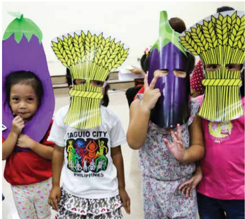
Children gamely wear vegetable masks at a workshop held in Pasig City in the Philippines to connect children's health and nutrition to environmental health.

In the Philippines, Greenpeace challenged young people to eat less meat and more vegetables. Through a series of camps for the youth group #IAmHampasLupa, 50 new young food activists helped raise awareness of the risks of meat consumption for our health and the planet.