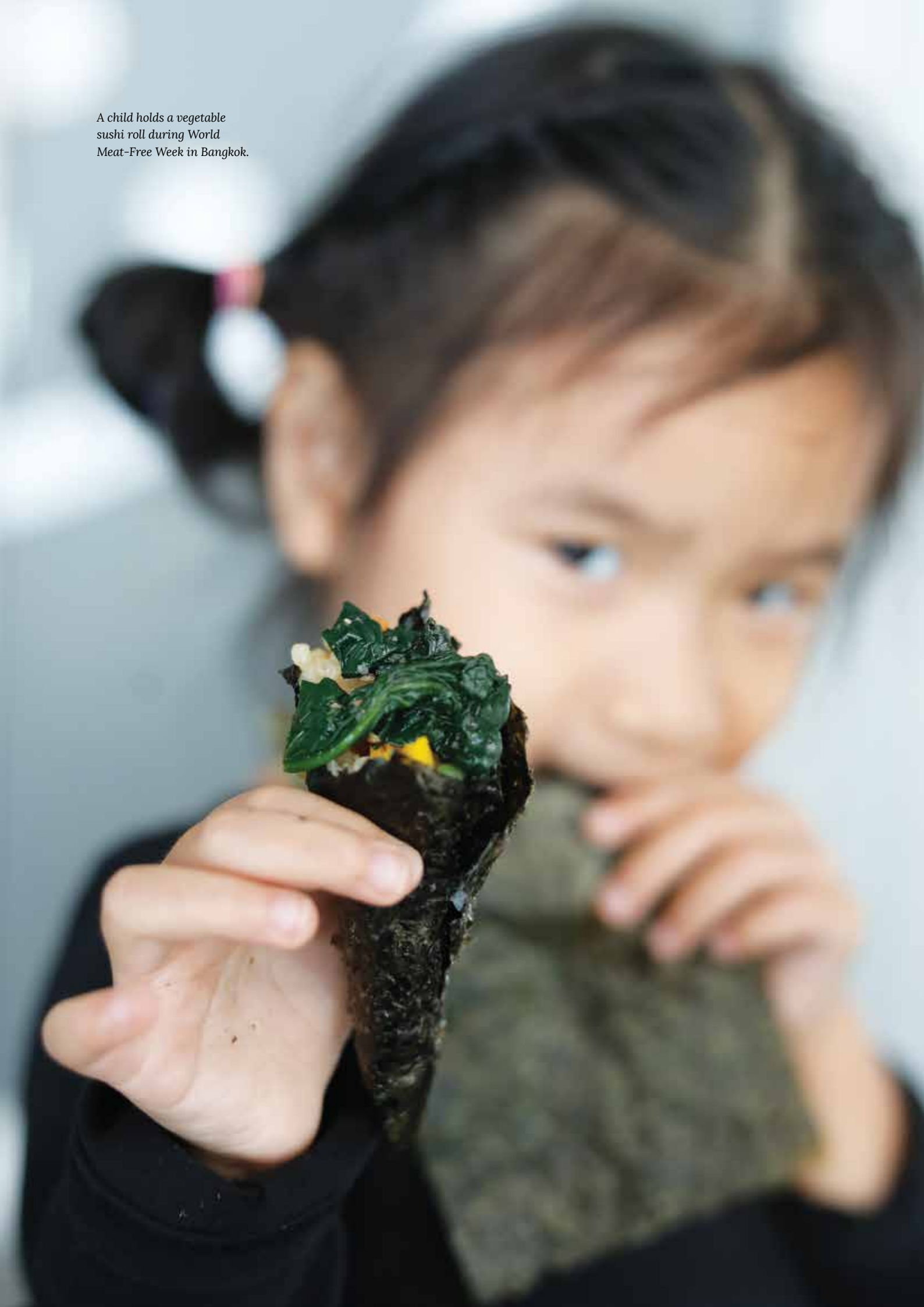
A child holds a vegetable sushi roll during World Meat-Free Week in Bangkok.