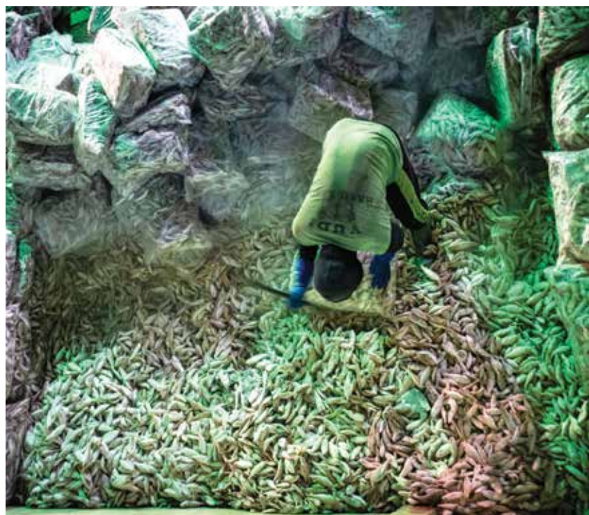
A fisherman unloads the catch at Tegal port, Central Java, Indonesia. Fishing is the primary source of work for many people living in the northern coast area of Java.

To empower small-scale local fishers and improve their practices, Greenpeace Thailand helped analyse the Fisheries Act. Due to major fisheries reforms in Thailand, the European Commission finally lifted the country's yellow card status, easing the seafood trade between Thailand and the European Union. In order to ensure the reforms are fully implemented, Greenpeace Southeast Asia continues its ocean fisheries works through the Beyond Seafood campaign in 2020-2021. ●