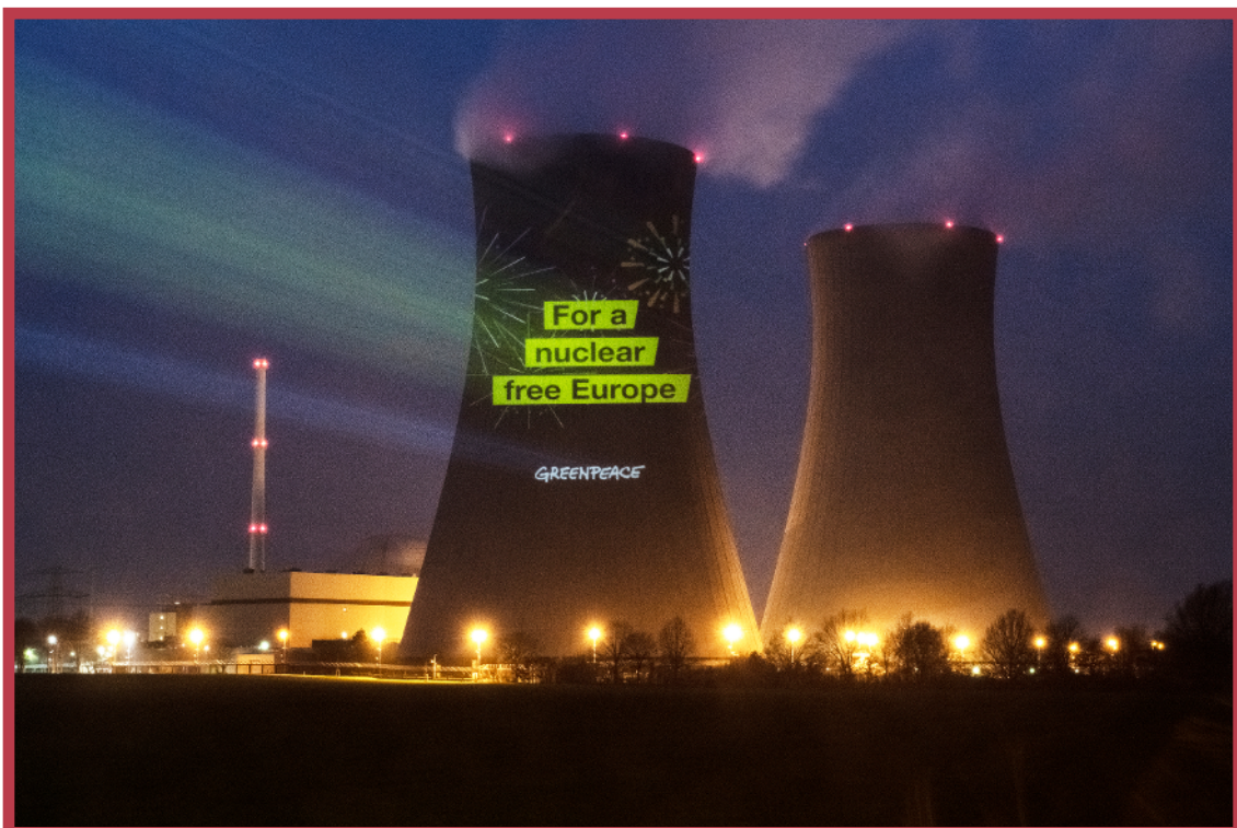
"For a nuclear-free Europe!" is projected on a cooling tower of the Grohnde nuclear power plant in Lower Saxony, Germany, which closed after 36 years in operation

In February 2022, Rosatom called the Commission's new delegated act including nuclear an important step in global recognition of nuclear as safe and sustainable. Rosatom complained, however, that "controversial" technical screening criteria would "restrict investments", such as time limits for the extension of existing nuclear plants, and the requirement to use accident-tolerant fuel. 173 In other words, like FORATOM, Rosatom wants even more favourable conditions for nuclear energy.