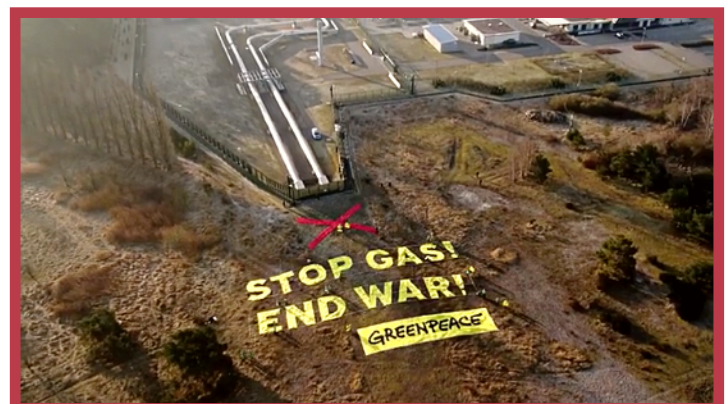
Greenpeace Germany activists protest the NordStream1 Baltic Sea pipeline operated by Gazprom, March 2022

A July 2021 report by Reclaim Finance – which exposes the gas industry's "lobbying bulldozer" to get gas in the Taxonomy – explains how companies externalize lobbying by hiring consultancies, noting that Gas Infrastructure Europe was a client of Nove. 35 Nove's current lobby register entry shows Gas Infrastructure Europe hired the firm in 2021 to work on files including the Taxonomy. 36 An archive of the EU's lobby register data, provided by lobbyfacts, shows that several more lobby firms have had Gazprom subsidiaries, or groups it's a member of, as a client in recent years, including Portland and Edelman Public Relations Worldwide. 37