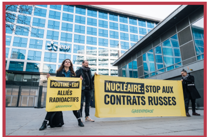
Greenpeace France volunteers protest the maintenance of commercial relations between the French nuclear industry and Rosatom at EDF headquarters in Paris.

EDF’s CEO spoke alongside Likachev on Rosatom’s high-level panel, and the two companies signed a joint declaration for long-term nuclear R&D during the WNE, following an April 2021 agreement on nuclear-based hydrogen. 163 EDF also pushed hard to get nuclear in the Taxonomy, demanding a technology neutral approach and railing against the excuse of “some unspecified, potential harm to other environmental objectives” that led to it initially not being recommended for inclusion. 164 EDF has had an impressive 50 meetings with MEPs, including two solely on the subject of the Taxonomy (though it may have been discussed at others), plus 52 top-level Commission meetings, including 4 specifically on sustainable finance/the Taxonomy. 165