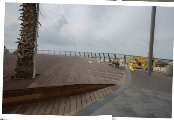
Tel Aviv Port and Promenade in Israel. 24/11/2013