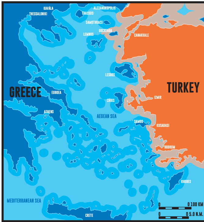
Map of the Aegean Sea, with approximate extent of current 6nm territorial waters.