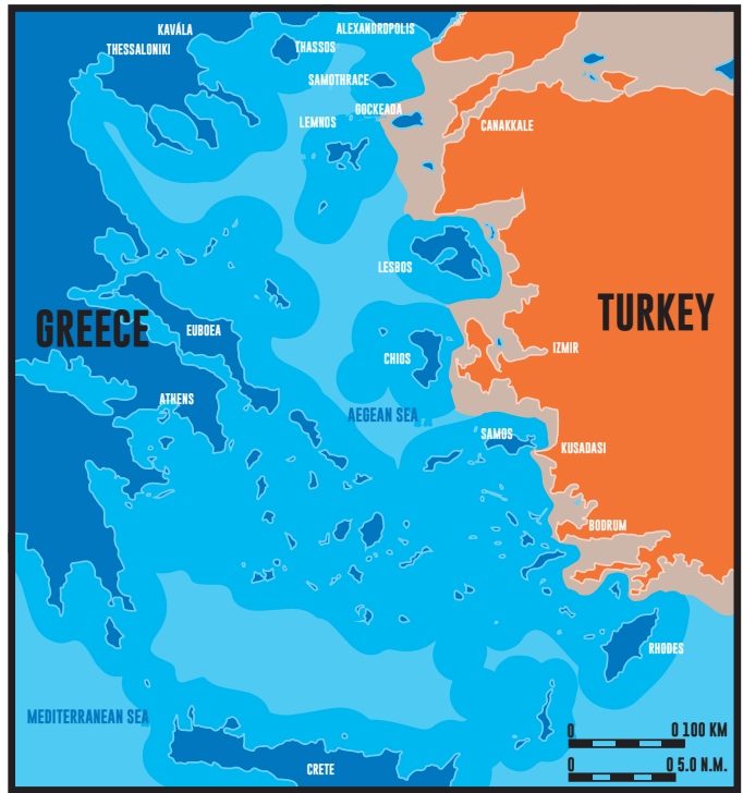
Map of the Aegean Sea, with approximate extent of current 12nm territorial waters.