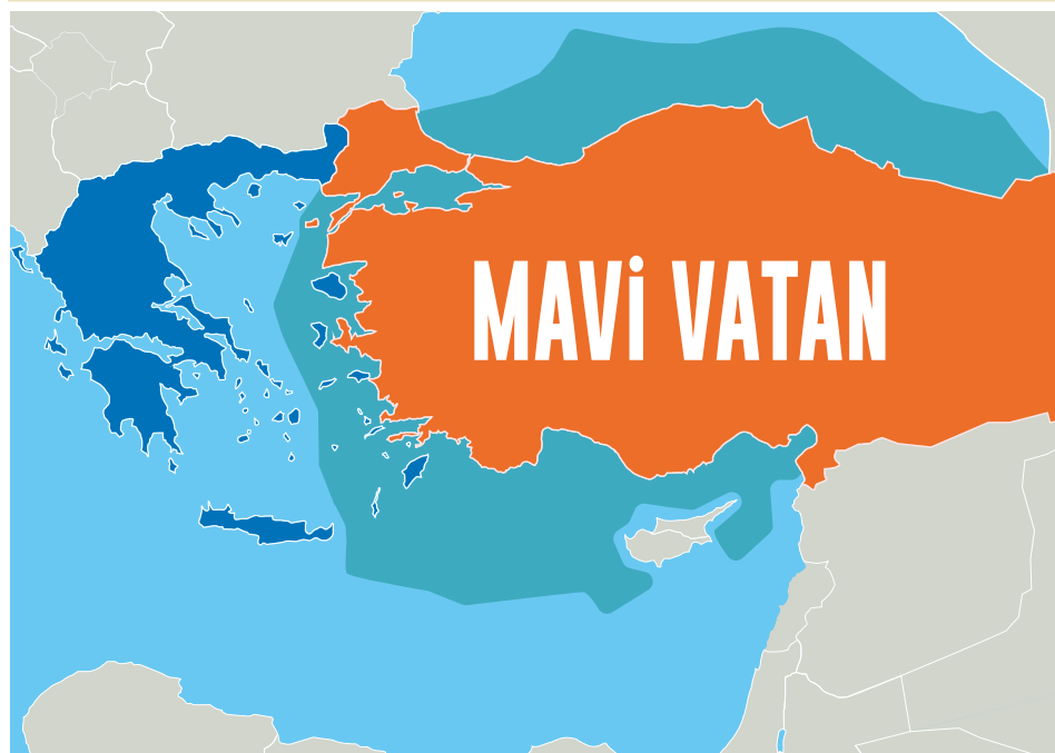
GRAPH 3 TURKEY'S PROJECTED MARITIME BOUNDARIES, ACCORDING TO THE ARCHITECTS OF THE BLUE HOMELAND DOCTRINE

Turkey. 52 In 2019, Turkey began to launch the annual naval exercises “Mavi Vatan” in the Black Sea and the Mediterranean, named in honour of this doctrine as an unequivocal message to Greece and Cyprus. 53