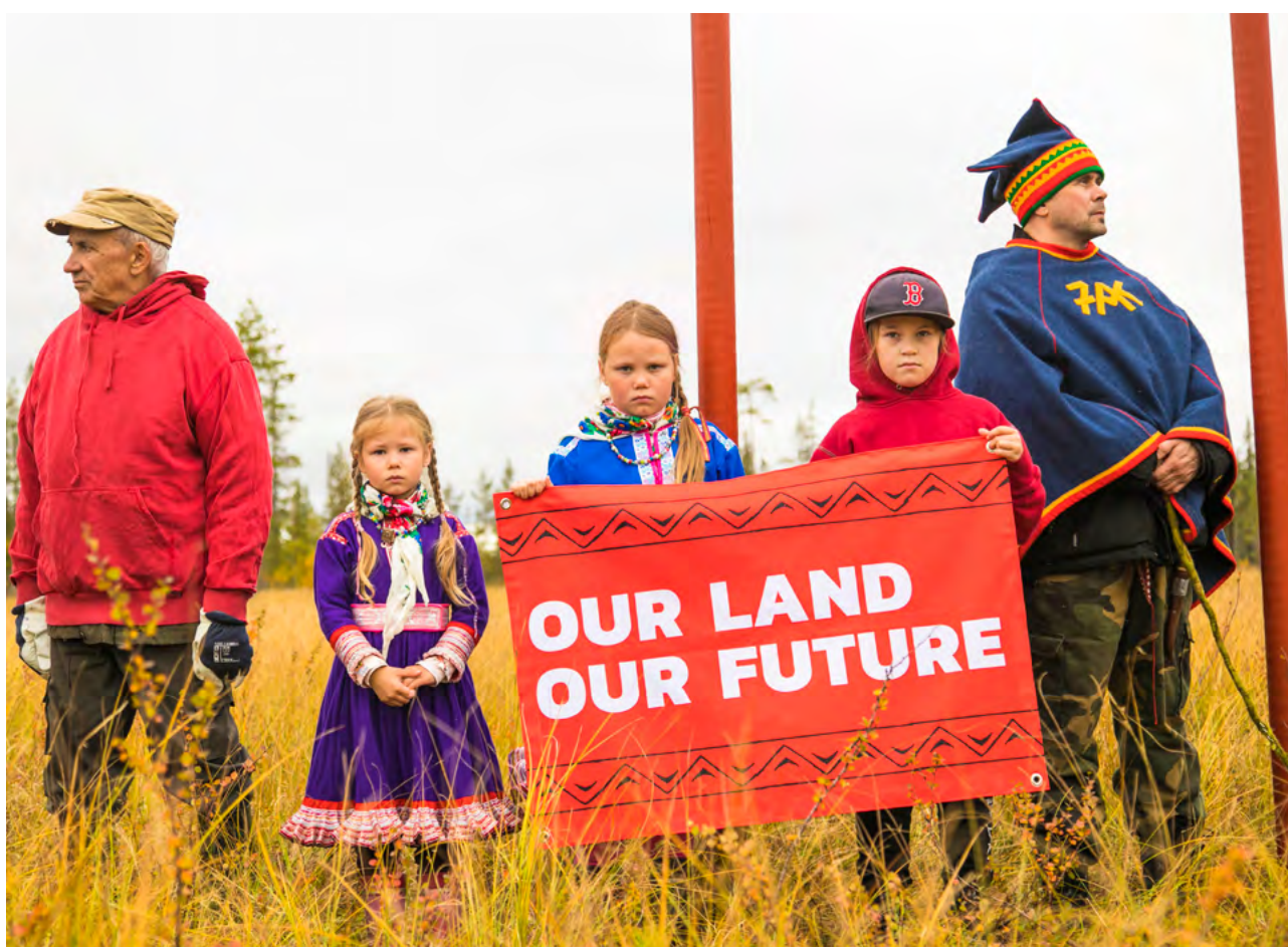
The Indigenous Sámi youth organisation Suoma Sámi Nuorat, Suohpanterror activist collective and Greenpeace activists join in a demonstration against industrial exploitation of the Great Northern Forest in the Sámi territory in northern Finland early September 2018.