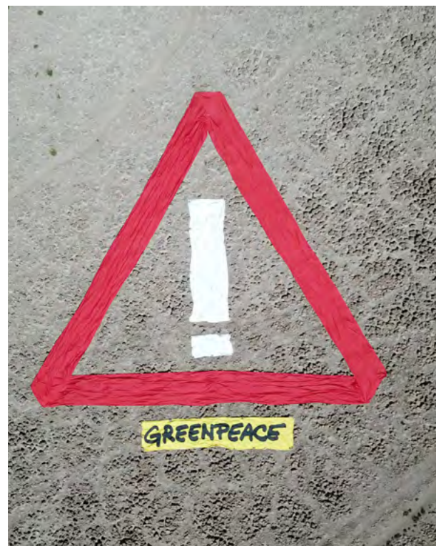
Greenpeace activists protest at the Laguna de Aculeo for urgent and ambitious action on climate.

of social justice, gender justice, rights-based and ecosystems approaches. Priority areas of focus for NMAs should therefore include land tenure and rights based approaches; external debt cancellation; just transition; ecosystems protection; landscape restoration; zero deforestation supply chains; enhanced traceability, accountability, and participation; and restorative justice initiatives.