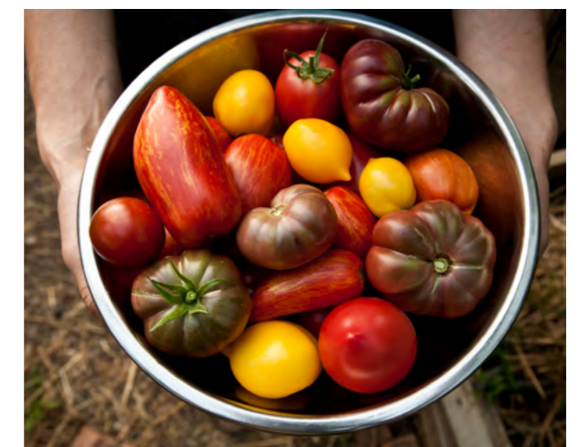
Top: Ecological farmer in Gümüşdere village, Turkey. Bottom: Produce from an Ecological Farm in Bulgaria.

stakeholders should be involved in its design and implementation.