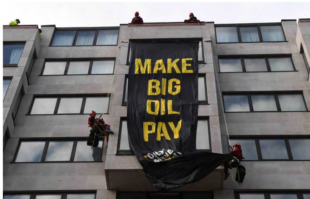
Activists outside Major Oil Conference in London. Hundreds of demonstrators gather in front of a Mayfair hotel to protest against the influence of the fossil fuel industry on UK and global climate politics.

The table below shows a range of financing options to support NMAs. The revenue estimates are for the whole amount that a particular tax or mechanism could raise and are not intended to pre-judge the share of this funding that would go to supporting NMAs. What this clearly shows, however, is that there is no shortage of financing that could be raised for NMAs but that the core problem is a lack of political will.