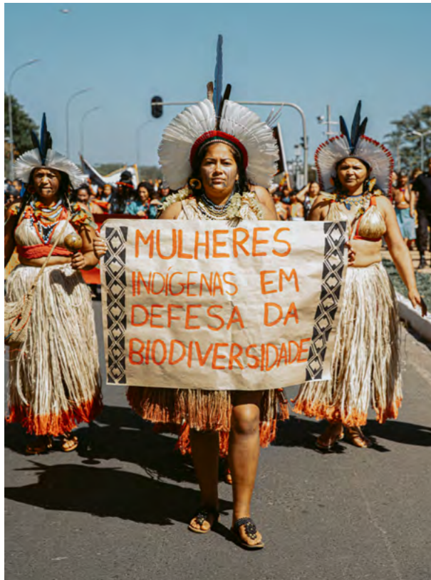
Thousands of Indigenous women from all over the country are gathering in Brasilia to advocate women's rights and the preservation of indigenous cultures. The march theme "Women Biomes in Defense of Biodiversity Through Ancestral Roots," at the heart of the march is a powerful call for equal rights for indigenous women.

NMAs to support ecosystem protection could support improved governance and management of land and territories, based on a participatory and rights-based approach and financial incentives that facilitate Indigenous Peoples and local communities, landowners and governments in maintaining primary forests and wetlands and improving conservation management. 23 For example, this might include support for a rural community that invests in ecosystem-based adaptation, natural carbon sink improvement and biodiversity protection through ecosystem protection and restoration.