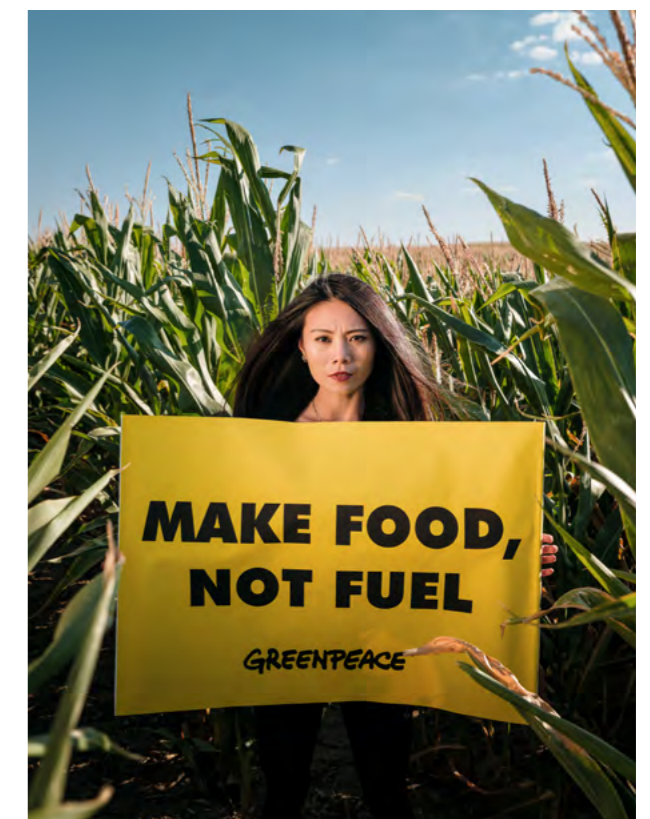
Photo OP in the sunflower and corn fields in Austria to build awareness regarding the use of crops as biofuels.

NMAs could offer a route for communities, regional or national governments facing irreversible climate impacts to negotiate settlements with fossil fuel companies, under the terms of which the latter may support a variety of needs, ranging from recovery and rehabilitation costs of rebuilding in the aftermath of climate disasters, to support for alternative livelihoods and risk planning tools. Restitution as part of the restorative justice approach could also be non-monetary – for example, through technology transfer or capacity-building.