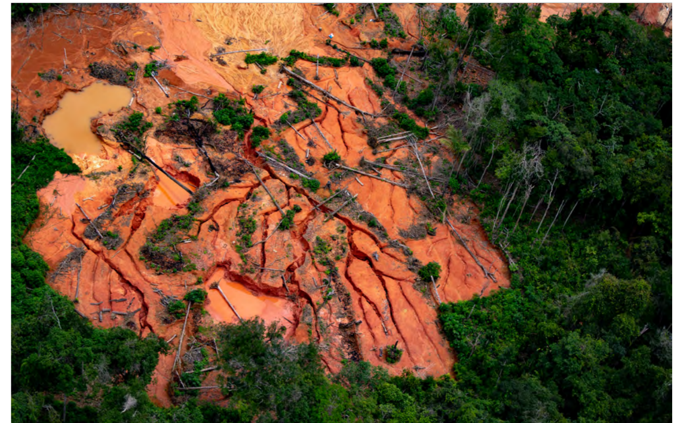
Overflight records areas of illegal mining within the Yanomani Indigenous Land in Roraima, Brazil in April 2021.

Article 6.8 can provide a platform for internationally coordinated climate actions which, consistent with the equity principles at the heart of the UNFCCC, would require new, additional, and predictable financing to be provided from developed to developing countries and other entities to enable their implementation. While developed countries claim there is a lack of public finance, and have failed to meet even the US$100 billion per year climate finance goal set at Copenhagen in 2009, this is not the case. Article 6.8 could help to ensure that there is some accountability when pledges of climate finance are made, such as the Glasgow Leaders’ Declaration (GLD) on Forests and Land Use. In addition, there are numerous possible sources of additional financing, ranging from windfall and wealth taxes, a levy on fossil fuel extraction (Climate Damages Tax), to increased support from philanthropy. These mechanisms have the capacity to