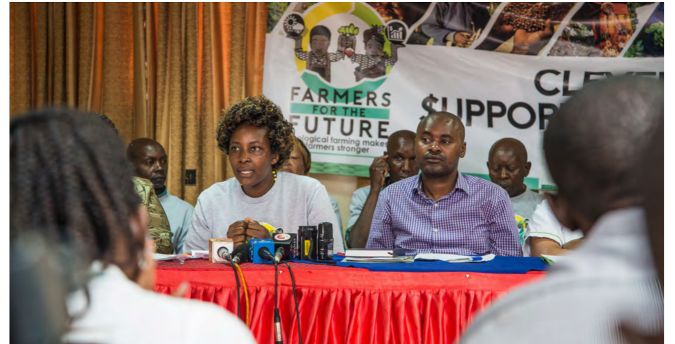
Press conference at Ecological Food Farmers' Trek Launch in Kenya.

Further, in 2019, the Intergovernmental Science-Policy Platform on Biodiversity and Ecosystem Services (IPBES), under the CBD, and the Intergovernmental Panel on Climate (IPCC) under the UNFCCC agreed to develop a technical paper on the interlinkage between biodiversity and climate change. 50 A co-sponsored workshop was subsequently held with the objective of bringing biodiversity to the forefront of land and ocean-based climate mitigation and adaptation discussions through a joint scientific publication. 51 The final joint IPBES / IPCC report delivered 41 conclusions offering guidance on the implementation of the Paris Agreement, the Post-2020 Global Biodiversity Framework, and the Sustainable Development Goals. 52