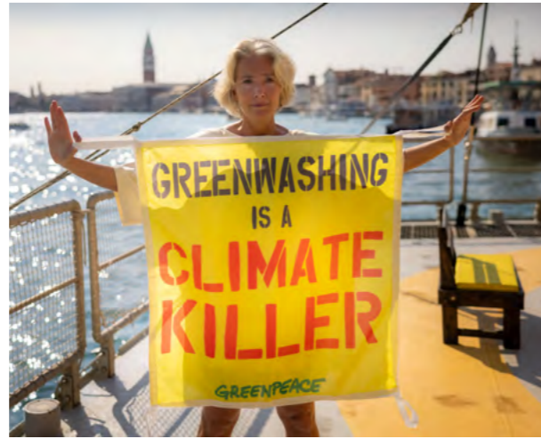
Emma Thompson on board the Greenpeace Rainbow Warrior in Venice supports the European Citizens' Initiative (ECI) to ban fossil fuel advertisements and sponsorships in the European Union holding a banner against greenwashing.

Article 6.8 provides a legitimate and transformative way to ‘course correct’ and stop wasting time and money on flawed and risky market mechanisms to greenwash further inaction. It must be embraced to move beyond market-based false solutions and prevent further entrenchment of the polycrisis.