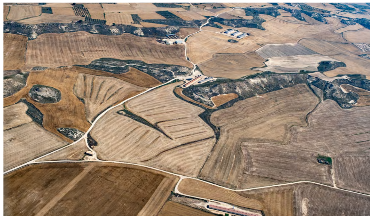
A dried up farm in Lecifena, Zaragoza, Aragón. Greenpeace visits different locations in Spain to document the impacts of drought. Apart from lack of rain, poor management and uncontrolled irrigation system are worsening the situation in the country. Around 75% of its territory is already at risk for desertification.

However, the options to support enhanced ambition directly through UNFCCC mechanisms have constraints. The emphasis on bottom-up approaches, a vital feature of the Paris Agreement, requires countries to lead through national actions, which can be limited. Article 6, however burdened with risk it may be, does at least provide for direct support of international cooperation through UNFCCC mechanisms. The intention of Article 6 is to enhance cooperation between countries to