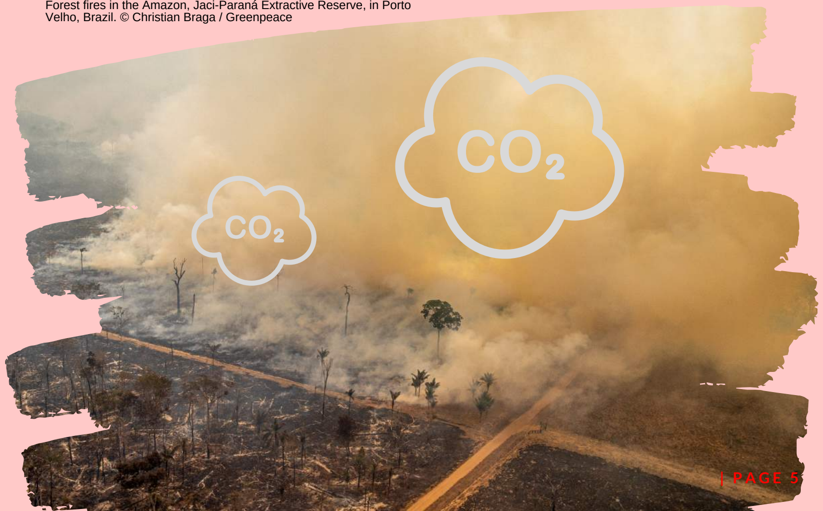
Forest fires in the Amazon, Jaci-Paraná Extractive Reserve, in Porto Velho, Brazil.

This analysis shows what different industry representatives and corporations are asking from EU decision-makers and exposes the misleading arguments they use to rationalise their position.