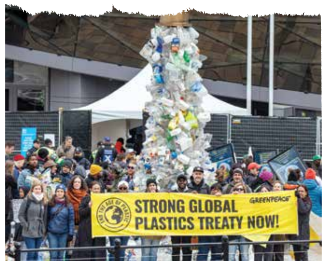
Mass Mobilization at INC4 Negotiation in Ottawa