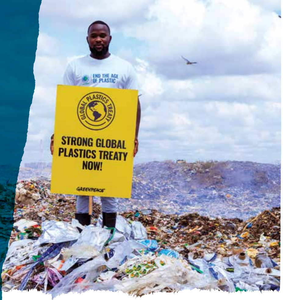
Banner at Dondora Dumpsite in Kenya

Your support is giving a voice to all the amazing animals - seabirds, dolphins, turtles and more - that are affected by plastic pollution.