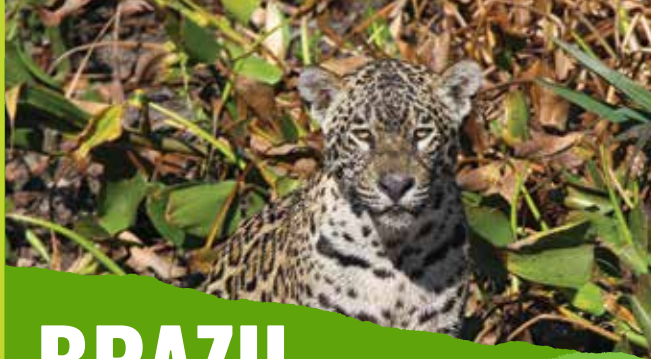
Jaguar in Mato Grosso, Brazil

Your support makes amazing things possible around the globe. Here are a few of the highlights from the past few months.