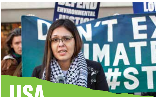
Stop Calcasieu Pass 2 Petition Delivery in the US

Passionate nature defenders from Greenpeace and Nature and Youth won over the Norwegian state in court in a case that challenged the legality of permitting three new oil and gas fields. The court found the drilling permits to be illegal because global climate impacts had not been adequately addressed in the environmental impact assessment. The judgement means production must end in these fields. This is an amazing step in the campaign to keep fossil fuels in the ground.