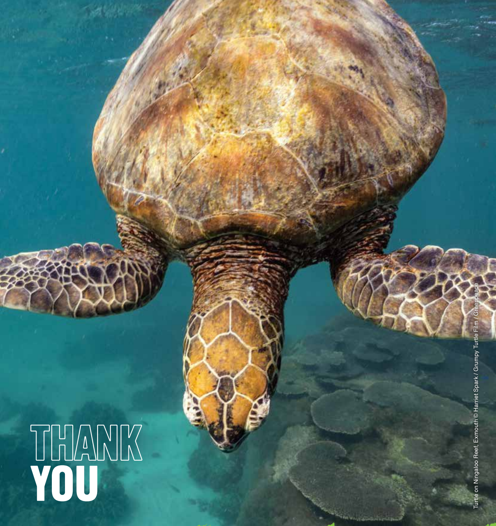
Turtle on Ningaloo Reef, Exmouth