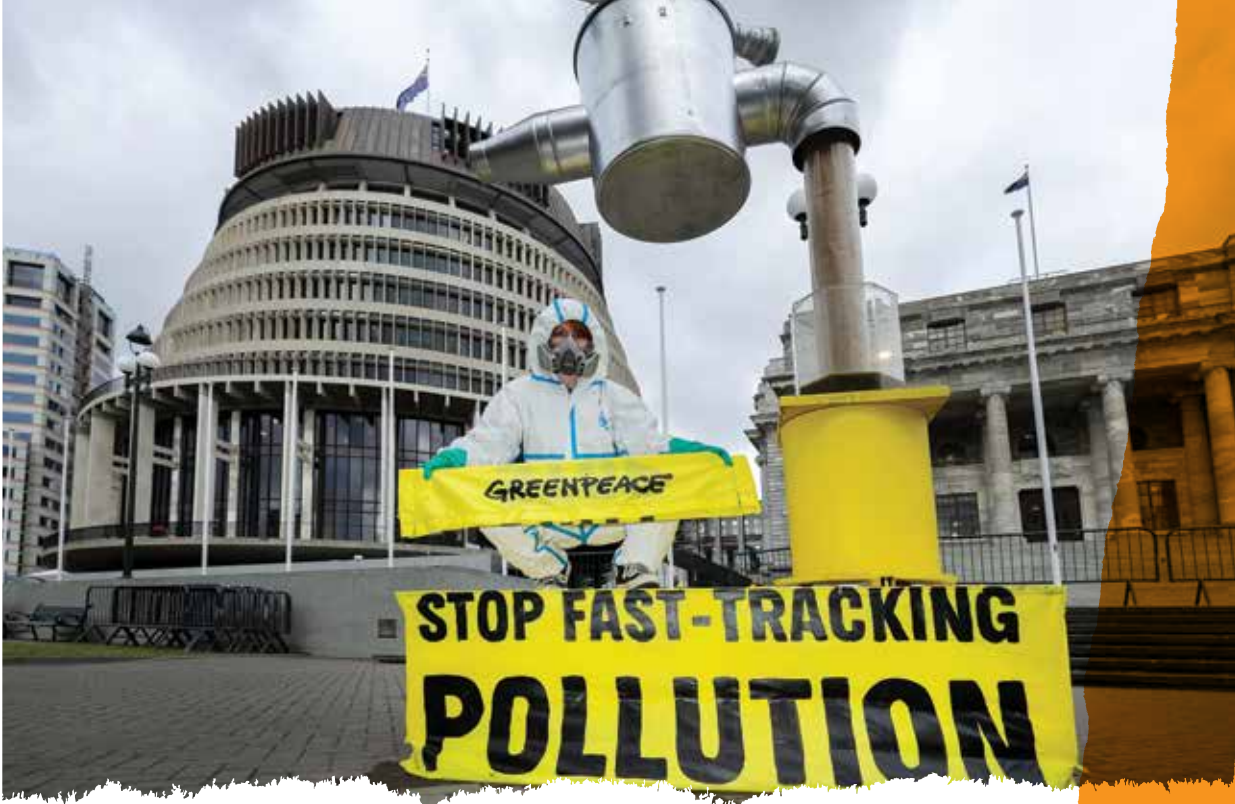
Stop Fast Tracking Pollution action at Parliament