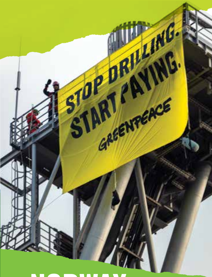
Shell Oil Platform with Greenpeace Activists

The Brazilian Supreme Court ruled that former President Jair Bolsonaro's administration actively promoted massive violation of socio-environmental rights in the Amazon. In a landmark decision on March 14, Brazil's Supreme Court recognized the existence of an "unconstitutional state of affairs" concerning environmental matters under Bolsonaro's administration. Greenpeace celebrates this historic decision by the Supreme Court, which mandates compliance with climate change targets established by national legislation and international agreements.