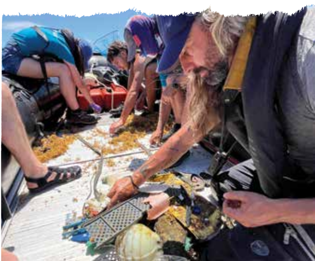
Collecting Plastic during the Sargasso Sea Ship Tour

Sign this petition to protect your world from plastic pollution: https://greenpeace.nz/GPT