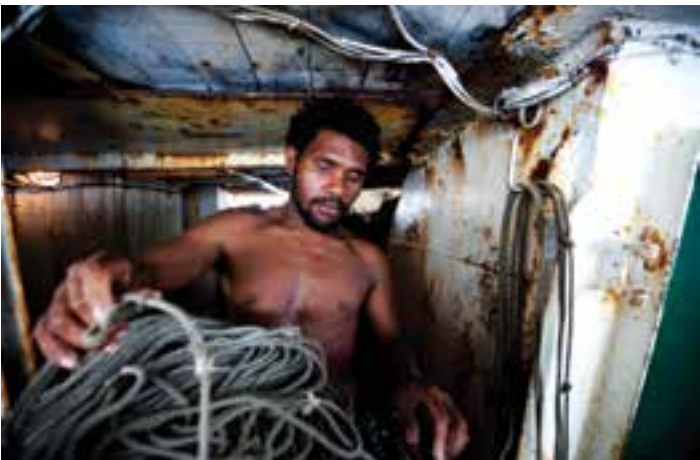
A crew member prepares longlines on board the Taiwanese fishing vessel Kai Jie 1. Greenpeace is calling for the closure of pockets of international waters in the Pacific to all types of fishing in order to rescue tuna from depletion of stocks. Longliners mainly target bigeye, yellowfin and albacore tuna, destined for sashimi markets in Japan and other countries where this food has become popular. Scientists have warned that some Pacific tuna stocks, such as bigeye and yellowfin tuna, are being fished beyond their limits. In addition, approximately 35% of longline catch consists of non-target species, including threatened oceanic sharks, and turtles.

International legislation and regional agreements are already in place to encourage capacity management, providing guidelines and frameworks.