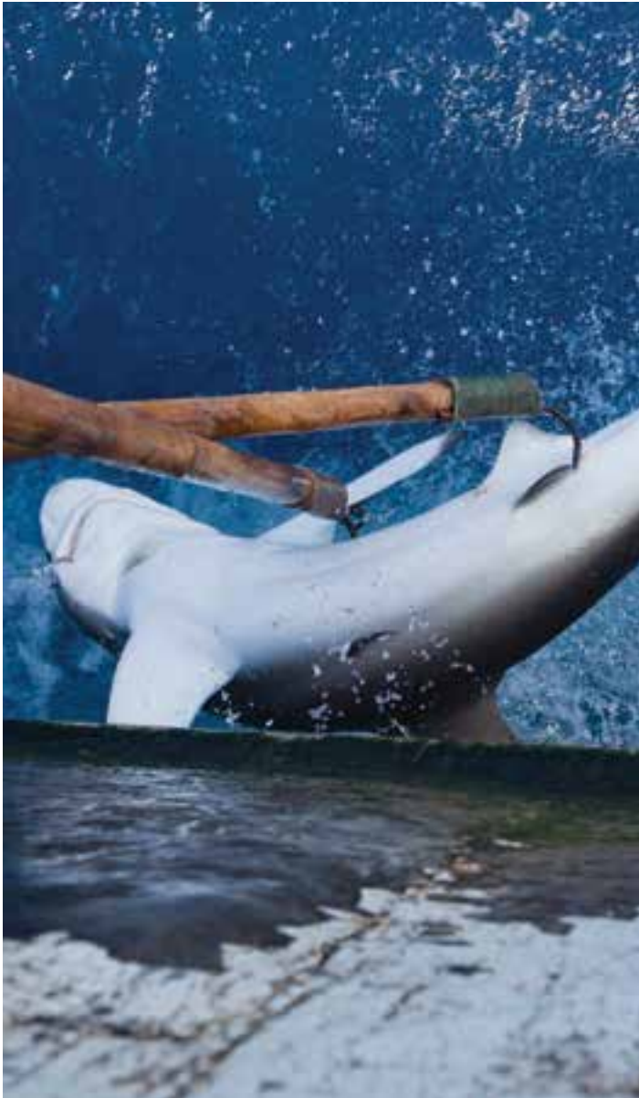
A shark is pulled from the depths on a Taiwanese longliner fishing in the Western and Central Pacific.