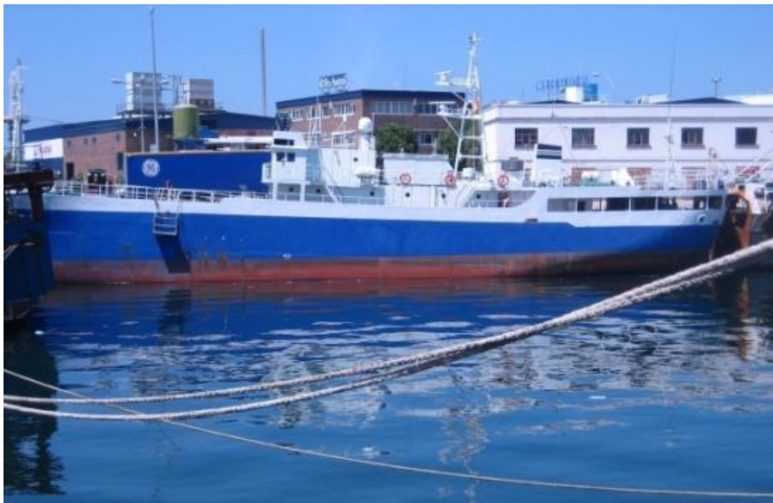
Pictures 19. A & B: Panama flagged large scale long line fishing vessel YARA (Ex-HOYO MARU 021) seen in Vigo, Spain on May 31 st 2007.