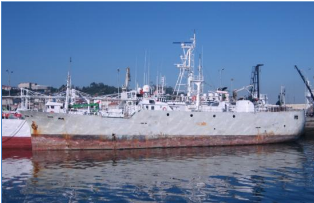
Pictures 22. A & B: Seychelles flagged large scale long line fishing vessel BOUZON (IRCS: S7PN ; YoB: 1977) seen in Marin, Spain on July 3 rd and 14 th 2007.