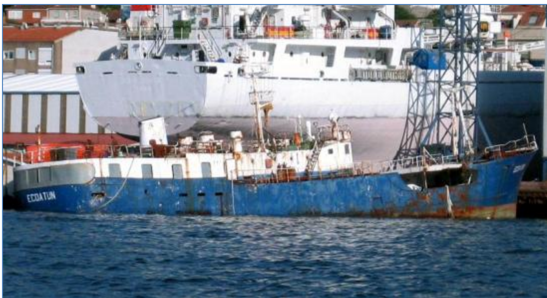
Pictures 29. A & B: Panama flagged large scale long line fishing vessel ECOATUN seen in Vigo, Spain on August 30 th 2007.