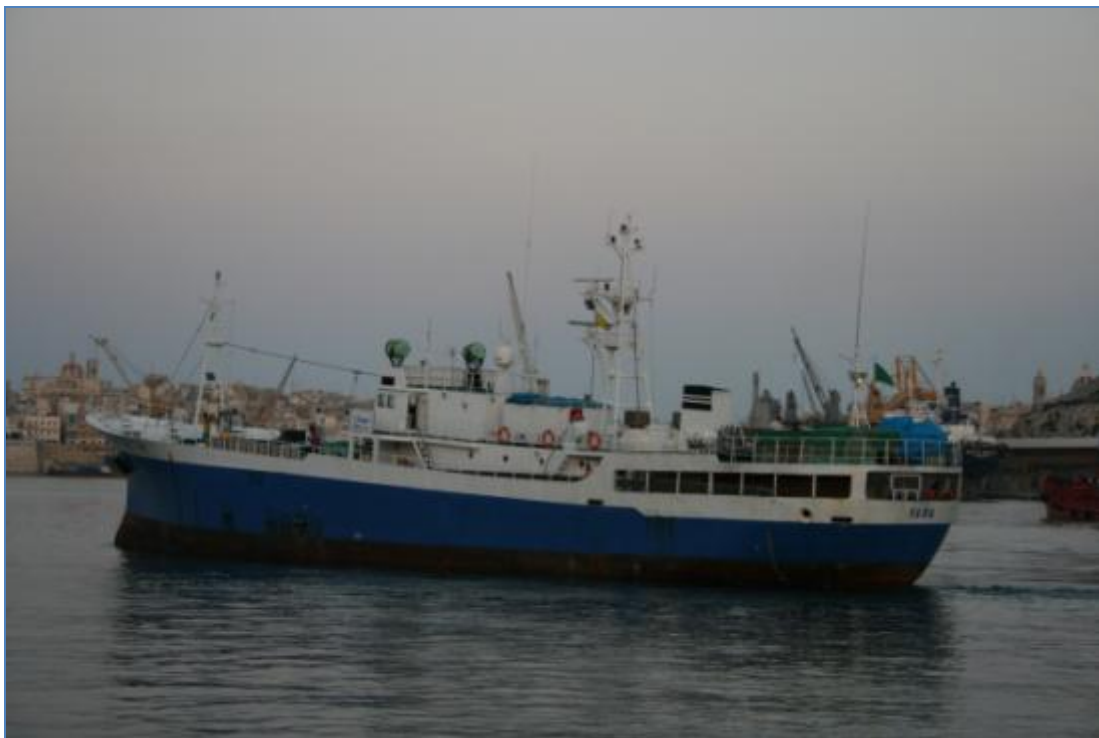
Pictures 20. A & B: Former Panama flagged large scale long line fishing vessel YARA (Ex-HOYO MARU 021) seen in the Port of La Valletta, Malta, flagged to Libya, on October 4 th 2007.