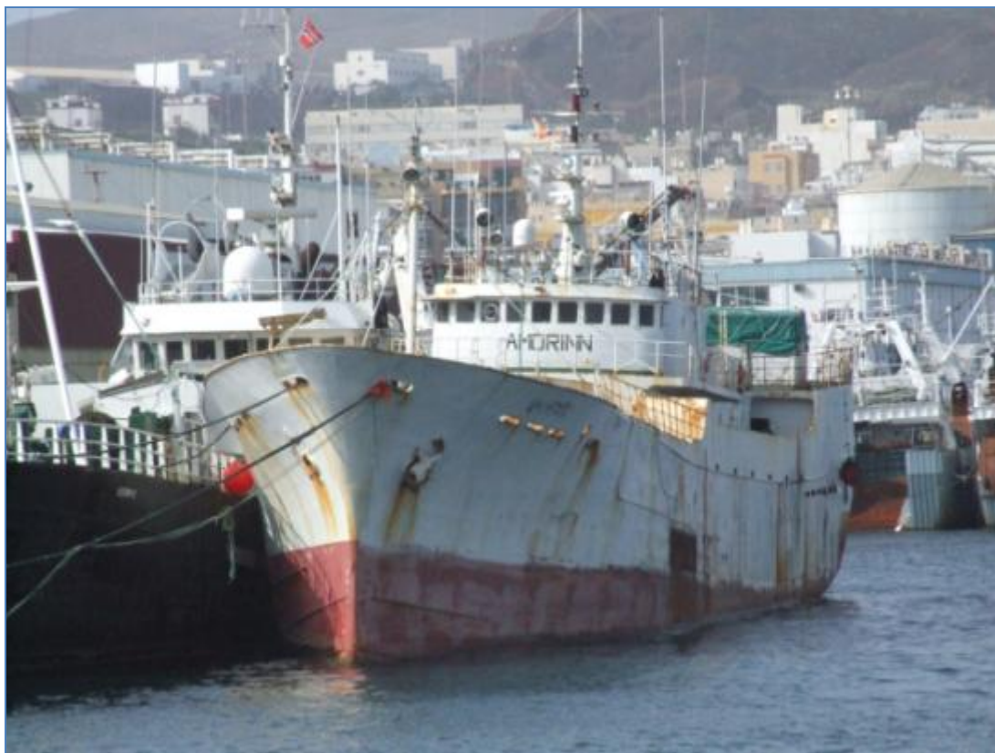
Picture 40.: Large scale long line fishing vessel AMORINN, flagged to Togo, seen for the last time, at Las Palmas on March 19 th 2007.