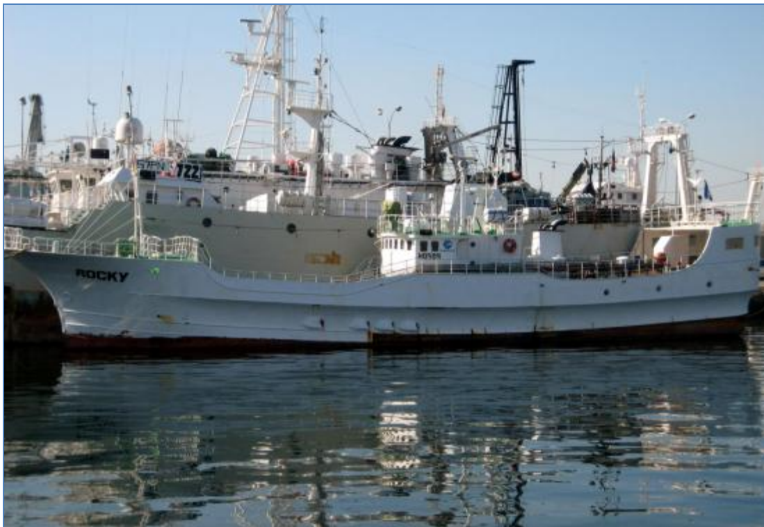
Pictures 42. A & B.: Large scale long line fishing vessel ROCKY, flagged to Honduras, seen at the Port of Marin on November 5 th 2007.