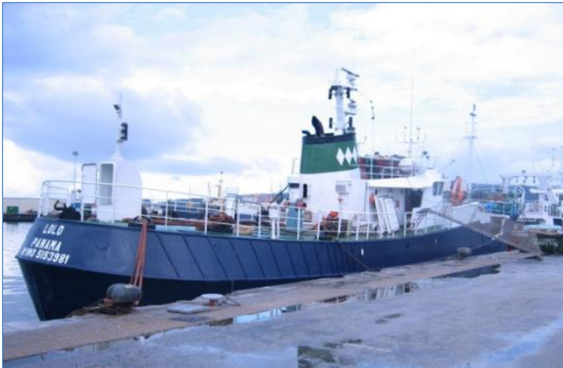
Pictures 18. A & B: Panama flagged large scale long line fishing vessel LOLO (Ex-HONDO) seen in Marin, Spain on June 19 th 2007.