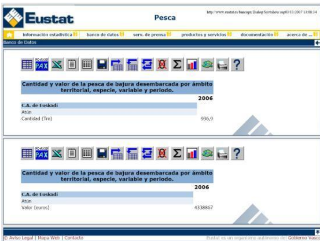
Picture 7: Total offloads of BFT having been effectively offloaded and sold at Basque fishing ports during 2006, according to EUSTAT (Departamento de Agricultura, Pesca y Alimentacion, Gobierno Vasco)

No statistical data was available on offloads of BFT at Basque fishing ports that had not been effectively sold at such ports but directly trucked to Spanish and/or French fishmongers.