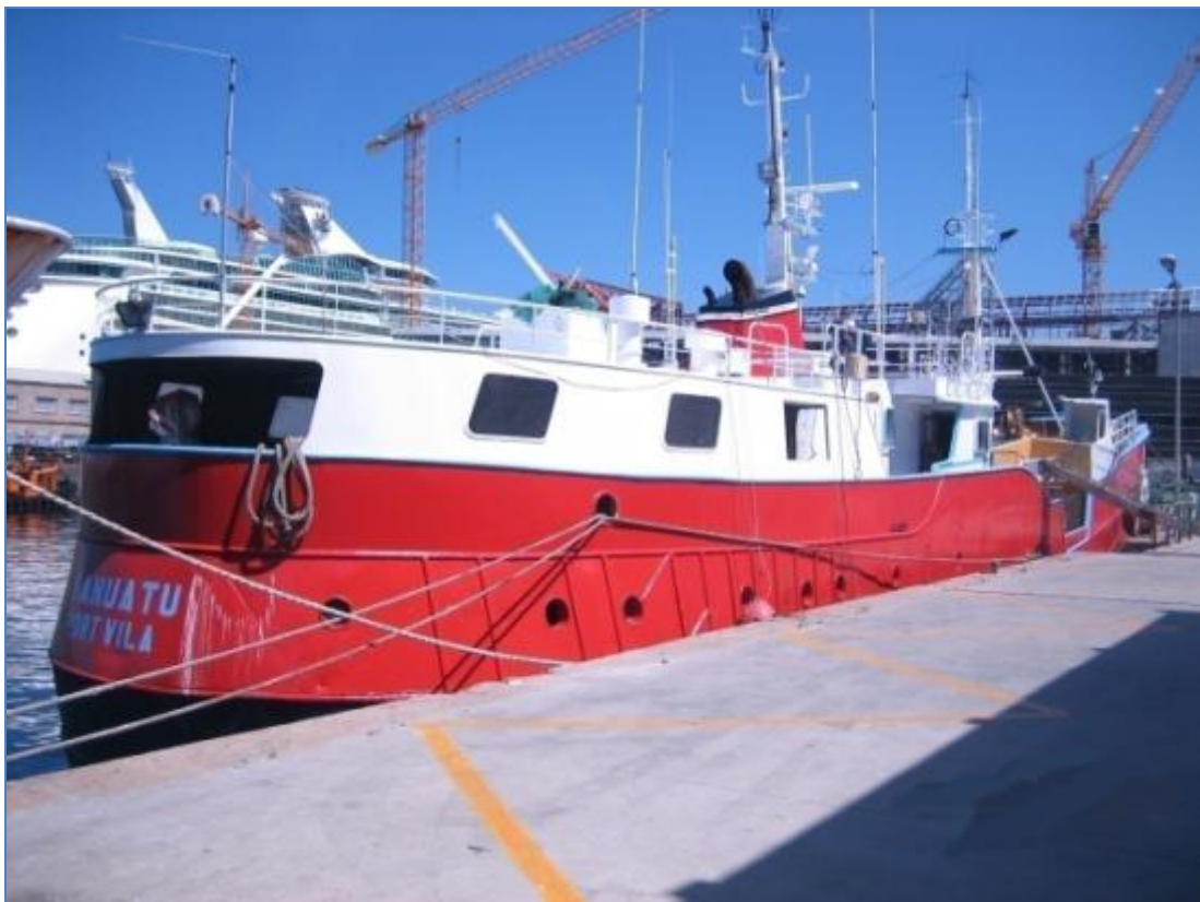
Pictures 25. A & B: Vanuatu flagged large scale long line fishing vessel NUEVO ATUN seen in Vigo, Spain on August 9 th 2007.