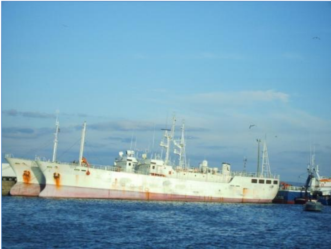
Picture 30.: Namibian flagged large scale long line fishing vessels AMAZONAS REEFER (Front) and ANTILLAS REEFER (Back) seen in Riveira, Spain in 2006.