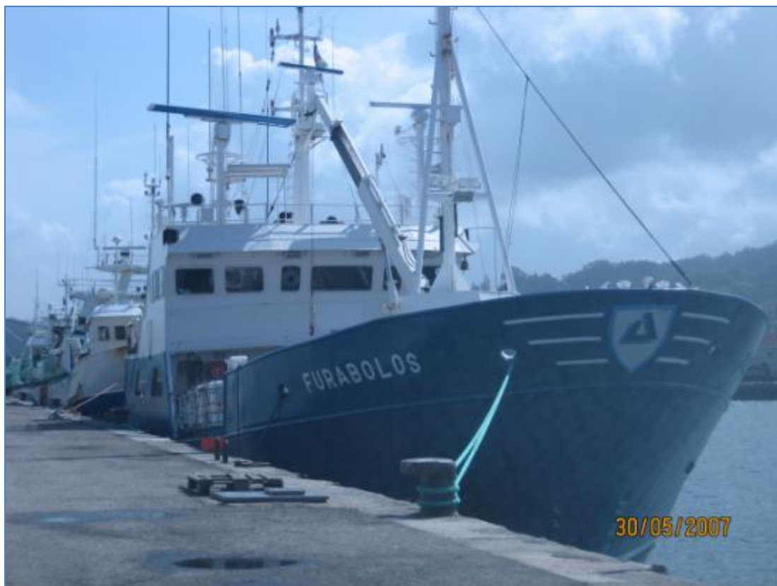
Pictures 34. A & B: Former Mauritius flagged large scale long line fishing vessel FURABOLOS (IMO 8604668, GT: 268, YoB: 1989) seen in Vigo, Spain on October 26 th 2006 (Top picture) and in Marin, Spain on May 30 th 2007 (Bottom picture), just before its departure to fishing grounds and after general repairs and FOC re-flagging.