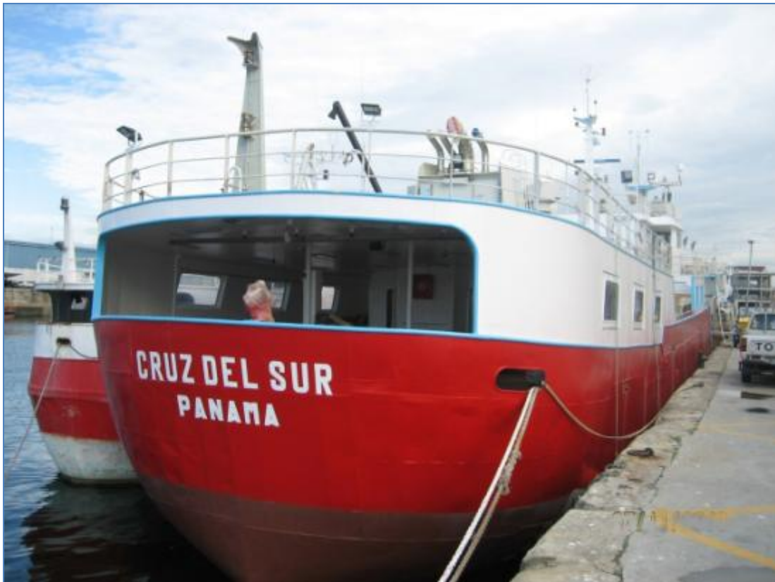
Pictures 28. A & B: Panama flagged large scale long line fishing vessel CRUZ DEL SUR seen in Vigo, Spain on January 18 th 2007.