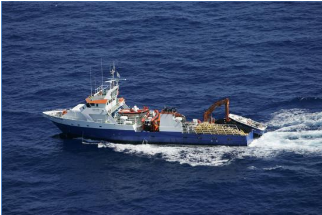
Picture 5: Spanish PS fishing vessel NUEVO ELORZ seen in the eastern Mediterranean on June 12 th 2006.