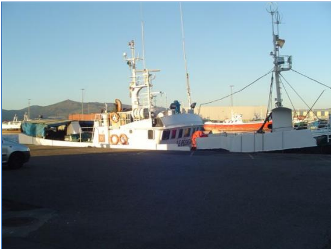
Pictures 36. A & B: Ivory Coast flagged large scale long line fishing vessel LE PECHEUR, seen in Vigo, Spain on September 27 th 2007.