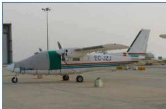
Pictures 11 .A & B: Spanish registered (EC-JZJ) tuna spotting Partenavia P-68B Victor Private23 aircraft, seen at Paphos Airport, Cyprus on May 5 th 2007. According to Industry sources, these two aircrafts would also operate two other 2-3 seats high wing airplanes from Alexandria airport (Egypt), through their Egyptian shipping agency company: Lucky Dolphin Marine Services. Web Site: www.luckydolphin.com .