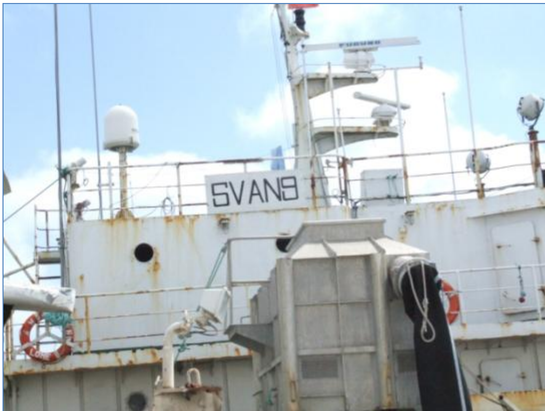
Picture 39.: Large scale long line fishing vessel AMORINN, flagged to Togo, seen at Las Palmas on March 11 th 2007.