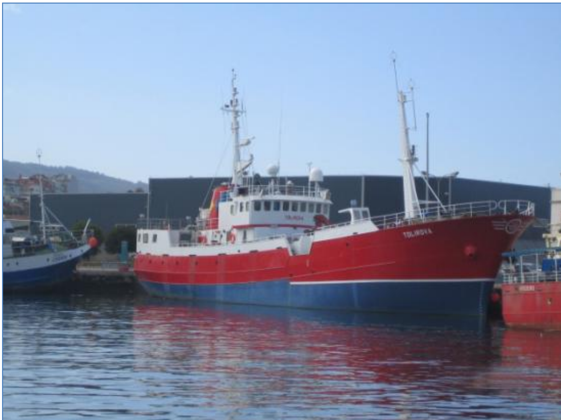
Picture 27.: Panama flagged large scale long line fishing vessel TOLIROVA (IRCS: HO4109 ; YoB: 1977) seen in Vigo, Spain on October 10 th 2005.