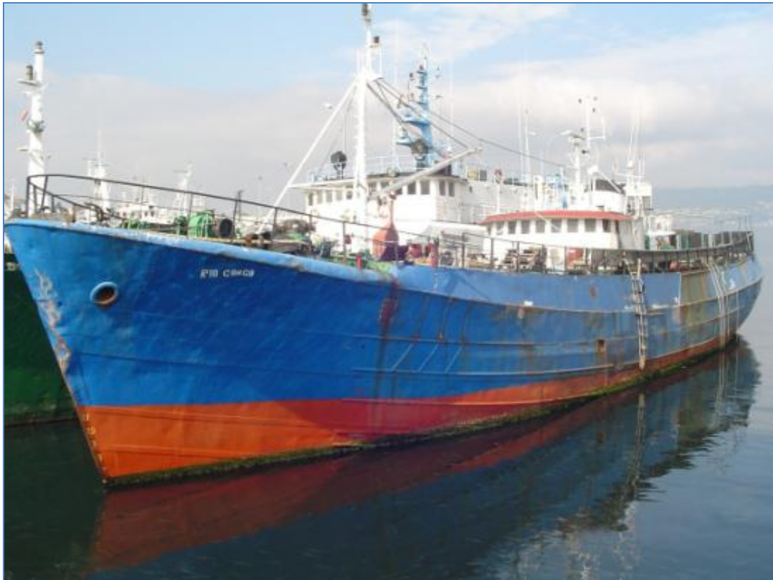
Picture 26.: Sao Tome e Principe flagged large scale long line fishing vessel RIO CONGO (IRCS: S9NM; YoB: 1959) seen in Marin, Spain on June 11 th 2007.