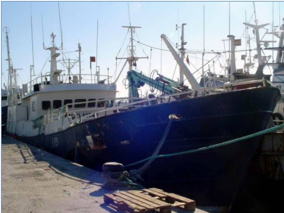
Pictures 41. A & B.: Large scale long line fishing vessel LADY LAURA, flagged to Honduras, seen at the Port of Riveira on November 3 rd 2007.