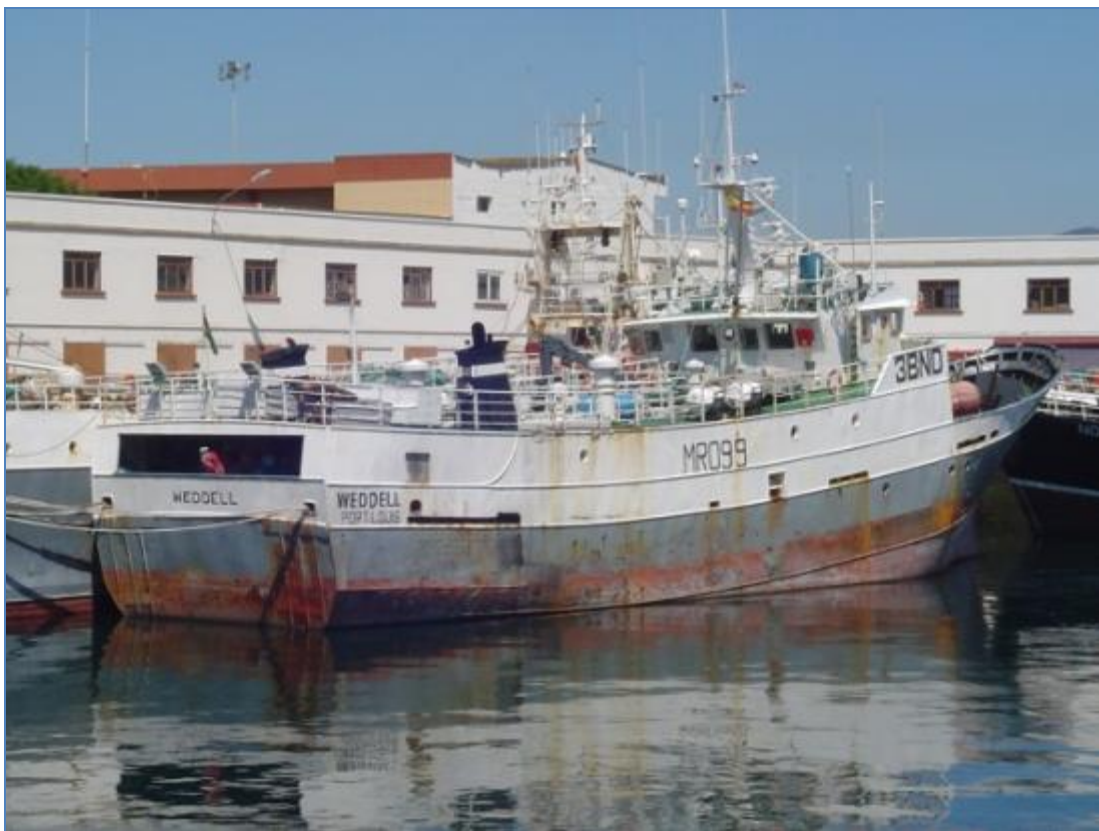
Pictures 35. A & B: Former Spanish flagged large scale long line fishing vessel PUENTE DE SAN TELMO, currently Mauritius flagged WEDDELL (IMO 738809, IRCS: 3BND, YoB: 1975, L/B/D: 39,78/8,82/4,02 m) seen in Vigo, Spain on February 18 th 2007 (Top picture) and again in Vigo, Spain on May 18 th 2007 (Bottom picture) Ship was still berthed at Vigo on September 1 st 2007.