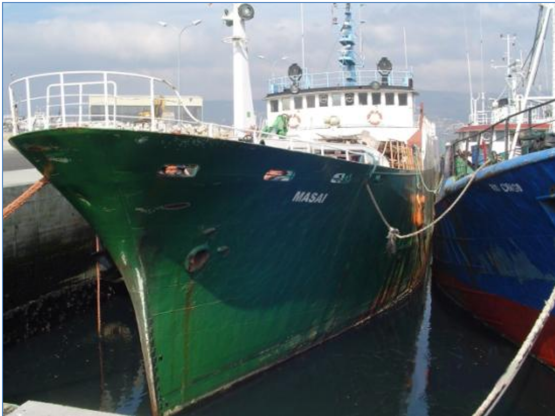
Pictures 24. A & B: Togo flagged large scale long line fishing vessel MASAI (Ex-KEIFUKU MARU 028) seen in Marin, Spain on June 11 th 2007.