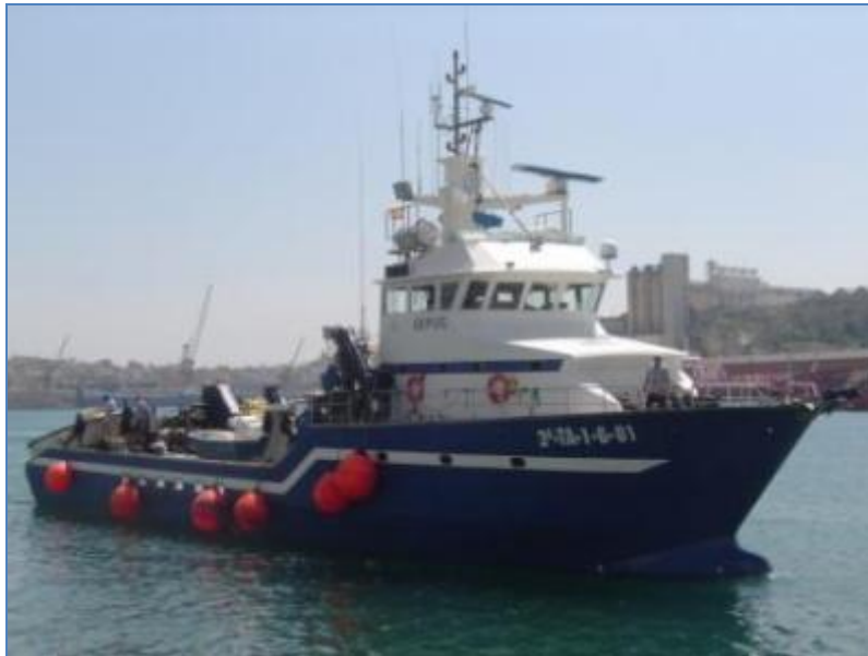
Picture 3: Spanish PS fishing vessel GEPUS, seen at the Port of La Valletta, Malta on May 9 th 2006.