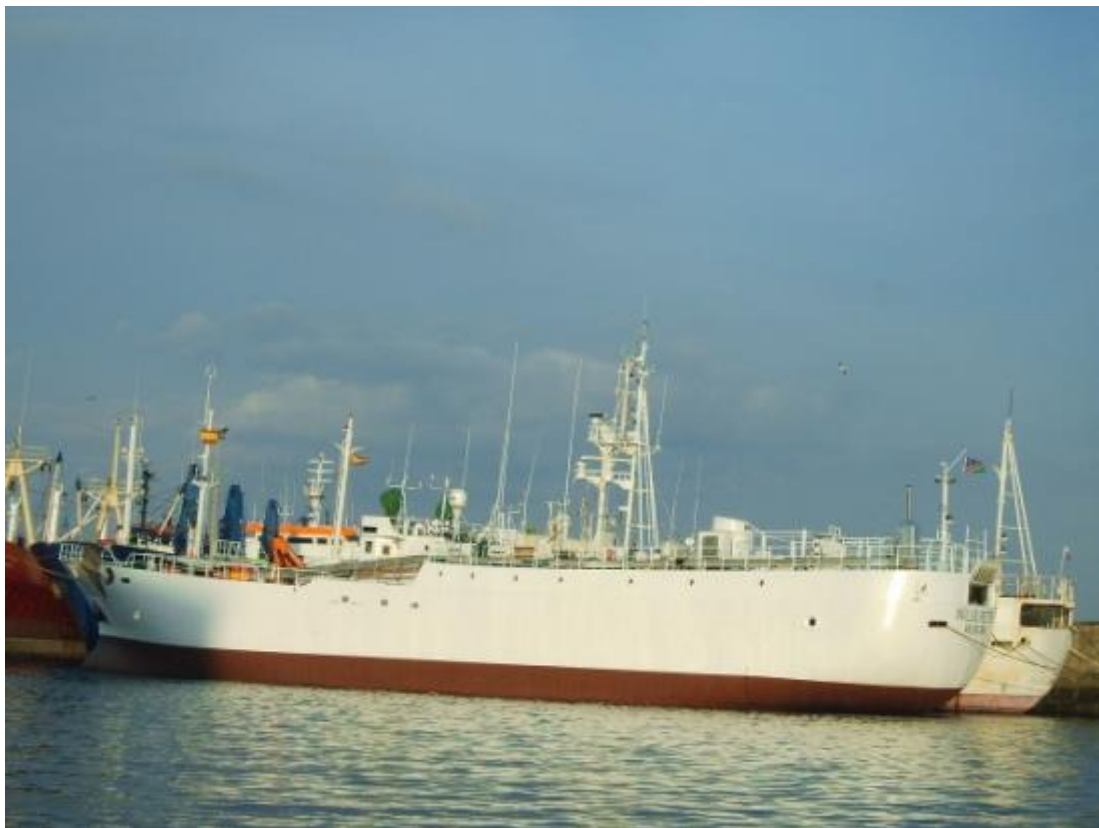
Picture 31.: Namibian flagged large scale long line fishing vessel ANTILLAS REEFER seen in Riveira, Spain April 1 st 2004.