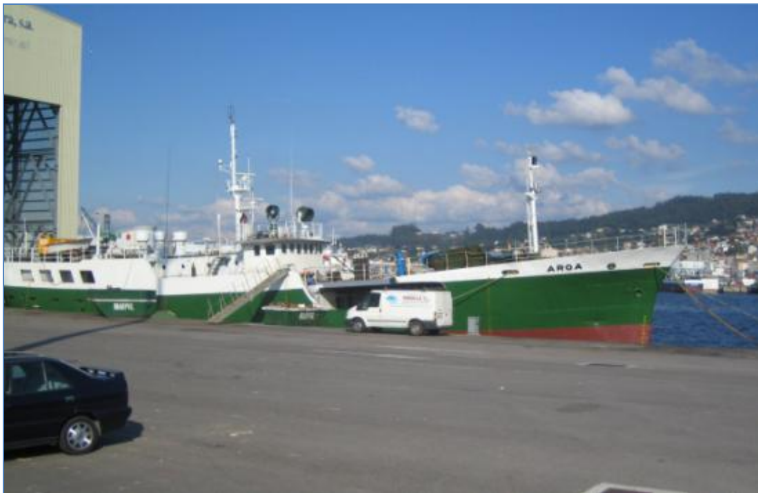
Pictures 21. A & B: Sao Tome e Principe flagged large scale long line fishing vessel AROA (IRCS: S9NG ; YoB: 1977 ; GRT: 232) seen in Marin, Spain on September 16 th 2005.