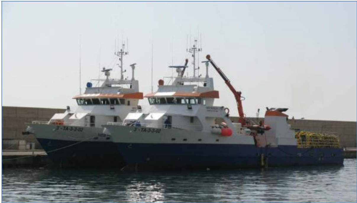
Picture 9. Spanish BFT PS vessels NUEVO ELORZ and NUEVO PANCHILLETA, seen at the Port of L'Ametlla de Mar, Tarragona, Spain, prior to their departure to Eastern Mediterranean before the 2007 BFT fishing started. Both ships called several times at Alexandria, Egypt for re-fuelling.