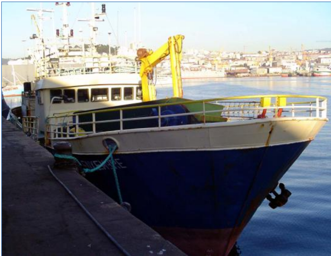
Pictures 17. A & B: Saint Kitts and Nevis flagged large scale long line fishing vessel ENSEMBRE (Former UK registered ATALYA) seen in Vigo, Spain, September 7 th 2007. Pictures©© Courtesy by: ATRT, SL.