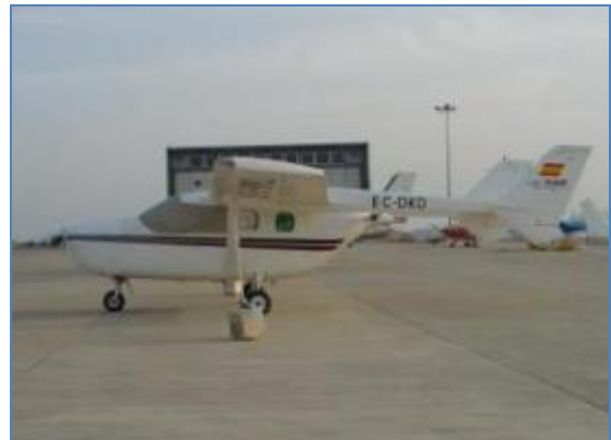
Pictures 10.A & B: Spanish registered (EC-DKD) tuna spotting Cessna Skymaster 337 aircraft, operated by Sociedad Aeronáutica Peninsular SL. seen at Paphos Airport, Cyprus on May 5 th 2007. EC-DKD was also seen at Malta Luqa Airport on April 26 th 2007.