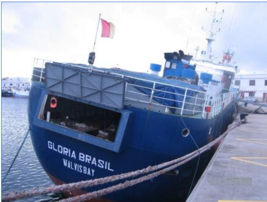
Pictures 13. A & B: Namibia flagged large scale long line fishing vessel GLORIA BRASIL 82 (Ex-ATLANTIC 052) seen in Vigo, Spain on July 1 st 2007.