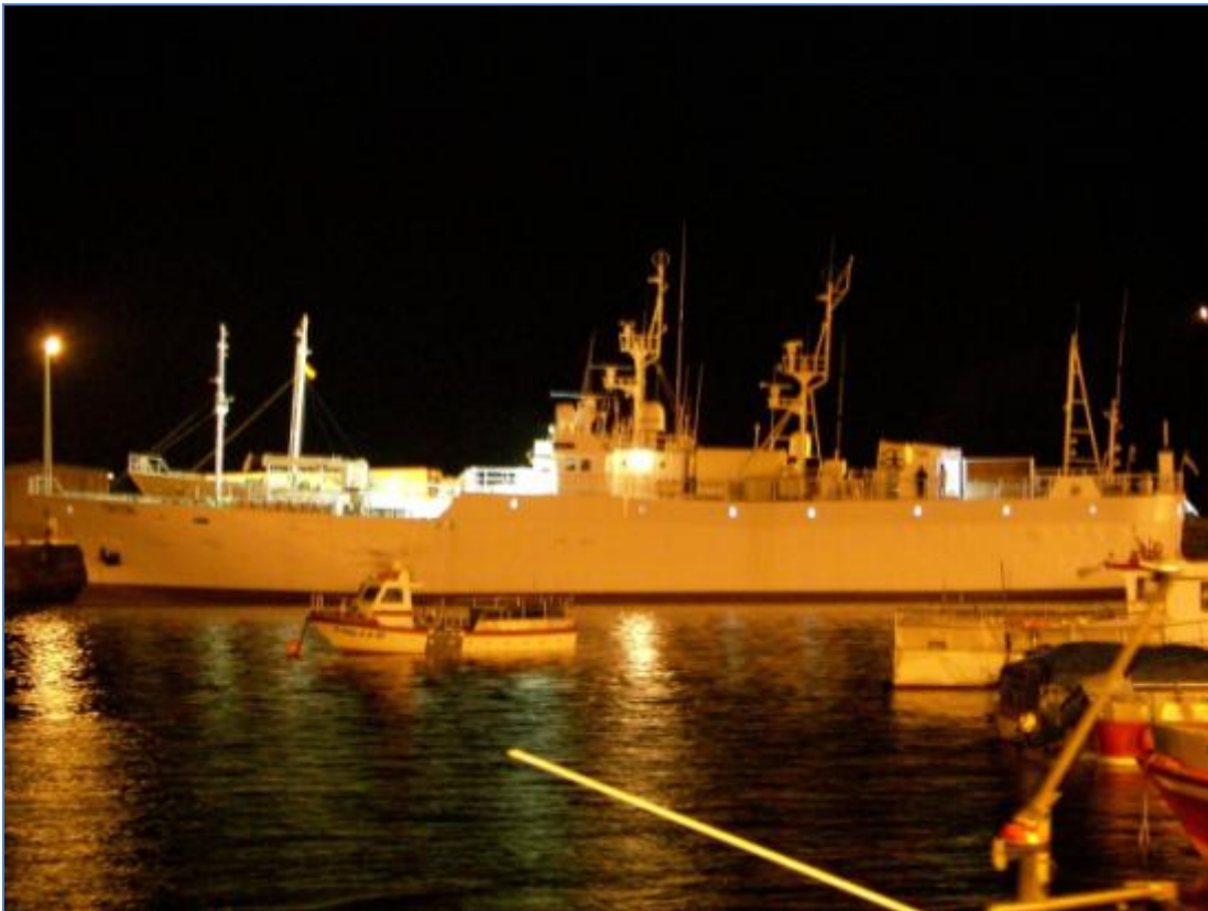
Picture 33.: Unknown flagged large scale long line fishing vessels TRITON seen in Riveira, Spain on December 9 th 2006.