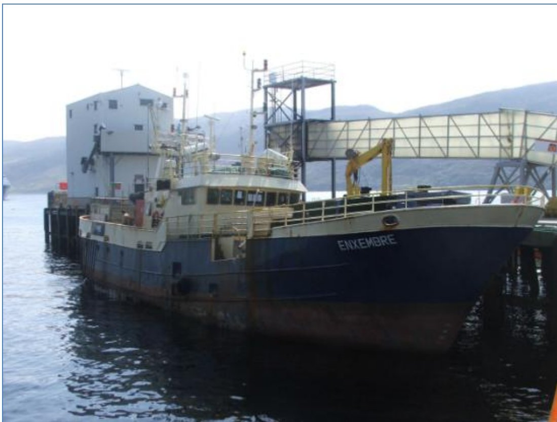
Pictures 16. A & B: Saint Kitts and Nevis flagged large scale long line fishing vessel ENXEMBRE (Former UK registered ATALYA) seen in at her berth at Ullapool in north west Scotland on August 22 nd 2007. Six Indonesian crew and a Chilean officer state that they are owed thousand of pounds in unpaid wages and are refusing to sail the ship. She is owned by Elcon Leisure based in Galicia, Spain. The Spanish owners had said they were going to fly another crew over from Portugal if the dispute wasn't settled quickly.