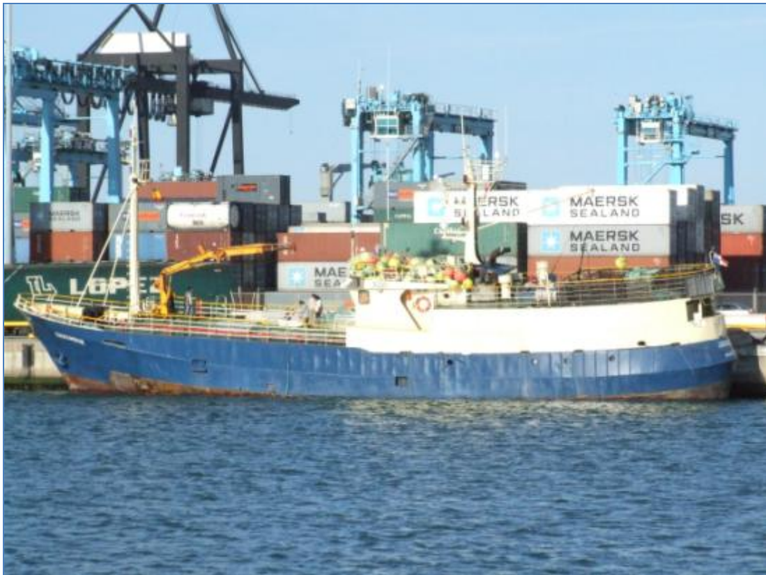
Pictures 15. A & B: Panama flagged large scale long line fishing vessel ENXEMBRE seen in Algeciras, Spain on May 14 th 2007