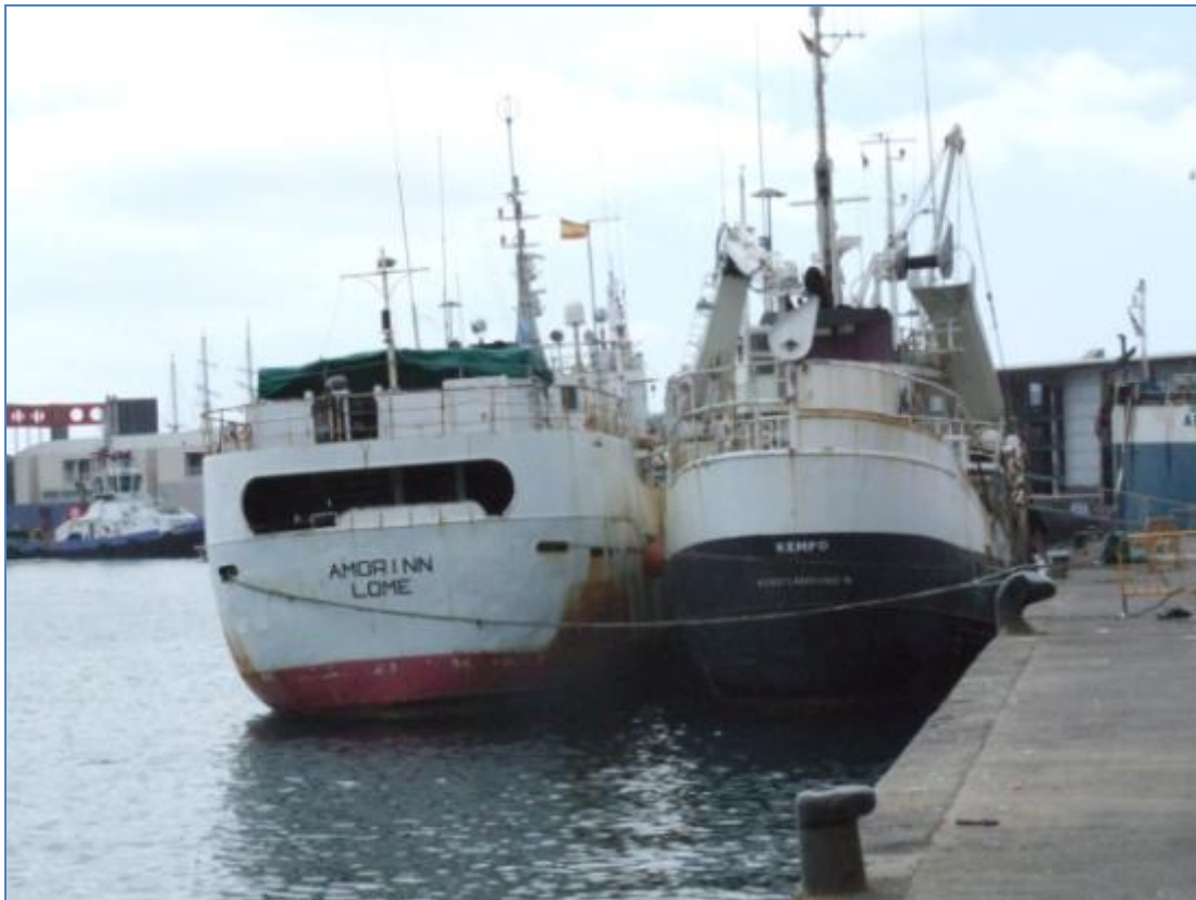
Picture 37. (Top) & Picture 38. (Bottom): Large scale long line fishing vessel AMORINN, flagged to Togo, seen at Las Palmas on March 11 th 2007.