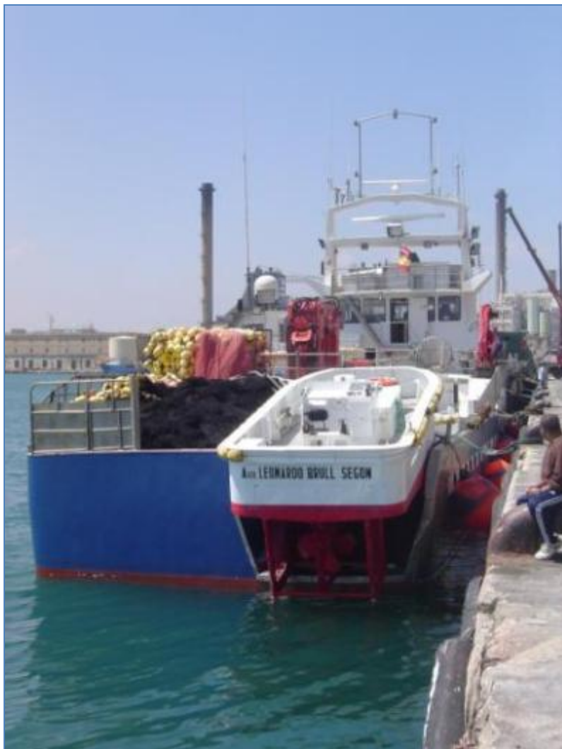
Picture 4: Spanish PS fishing vessel LEONARDO BRULL SECON seen at the Port of La Valletta, Malta on May 9 th 2006.