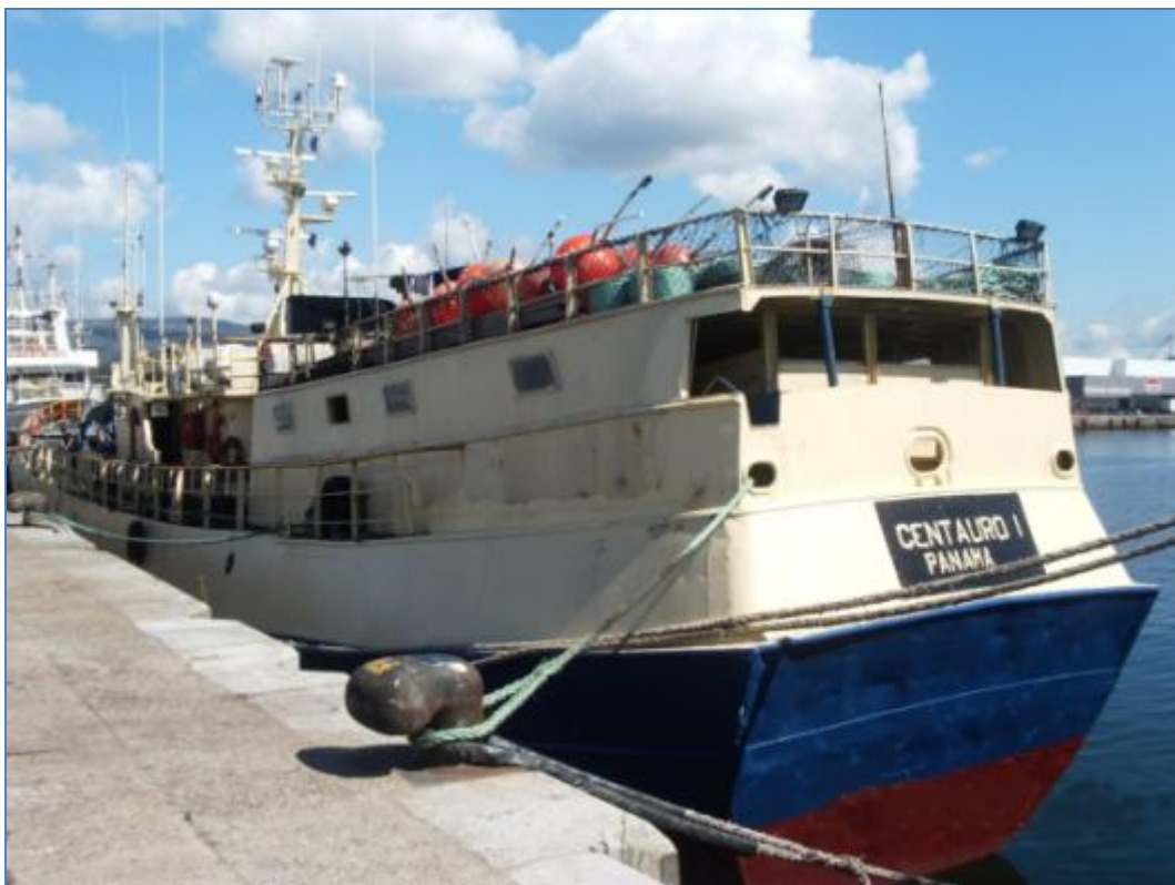
Pictures 14. A & B: Panama flagged large scale long line fishing vessel CENTAURO I (Ex-CAM LYNX) seen in Marin, Spain on May 16 th 2007.