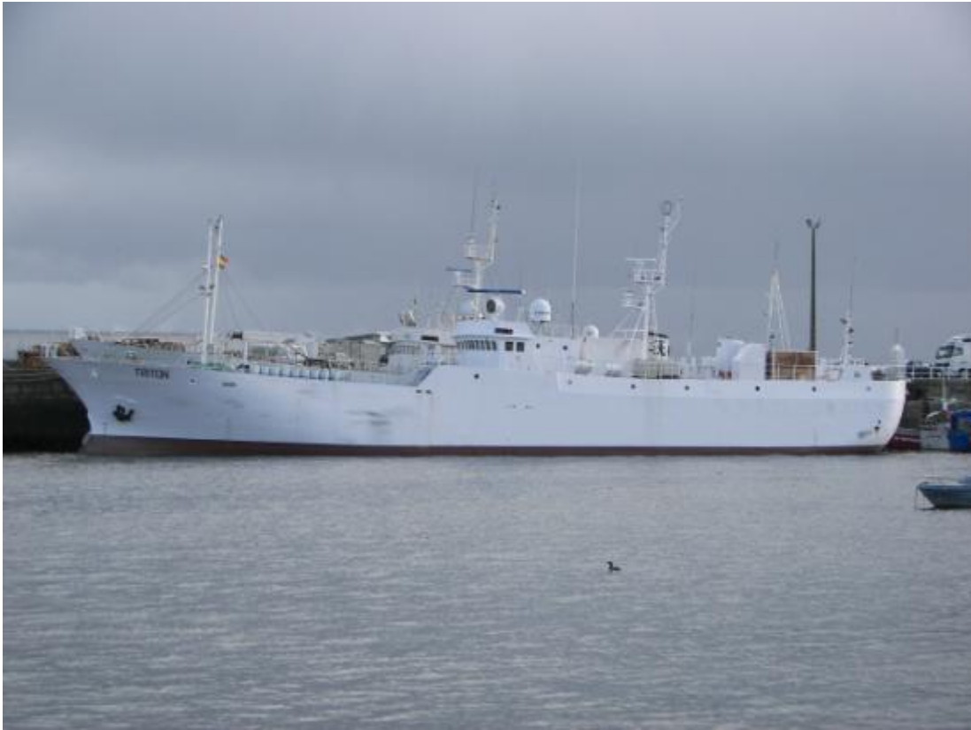
Picture 32.: Unknown flagged large scale long line fishing vessel TRITON seen in Riveira, Spain on December 9 th 2006.