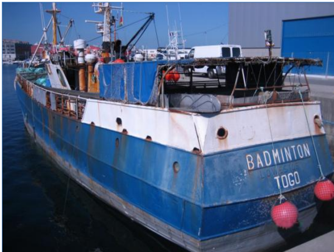
Pictures 23. A & B: Togo flagged large scale long line fishing vessel BADMINTON seen in Vigo, Spain on July 29 th 2007.