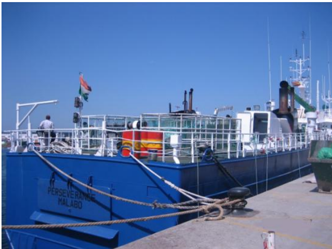
Pictures 12. A & B: Equatorial Guinea flagged large scale long line fishing vessel PERSEVERANCE (Ex-MILA 2) seen in Vigo, Spain on August 4 th 2007.