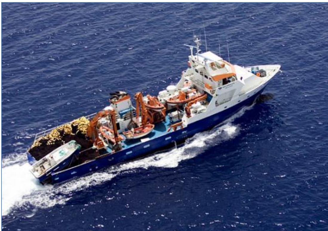
Picture 6: Spanish PS fishing vessel NUEVO PANCHILLETA seen in the eastern Mediterranean on June 3 rd 2006.